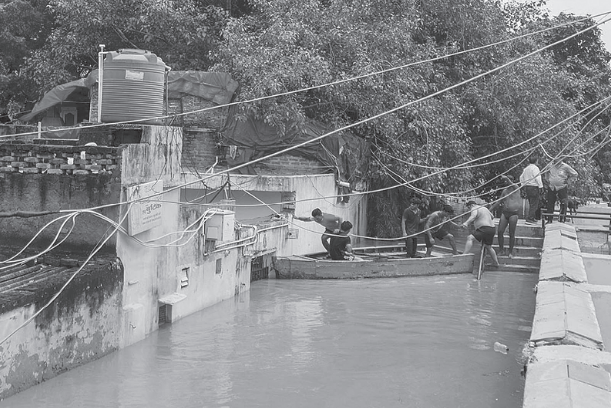
People use a boat to move through a flooded area as the water level of the Yamuna river continues to rise, in New Delhi. More than 7,500 people have been evacuated from low-lying flooded areas as the Yamuna river level rose to 207 metres at the Old Railway Bridge (ORB) on Wednesday at 1 pm, officials said.