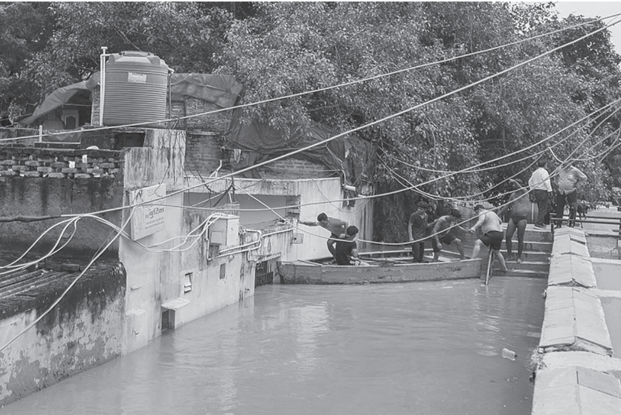
People use a boat to move through a flooded area as the water level of the Yamuna river continues to rise, in New Delhi. More than 7,500 people have been evacuated from low-lying flooded areas as the Yamuna river level rose to 207 metres at the Old Railway Bridge (ORB) on Wednesday at 1 pm, officials said.

The forest department has taken serious note of the incident and has started an investigation. Forest department officials have informed that plans are being made to instal cages to catch the leopards in the area. They have also appealed to the villagers to be vigilant.