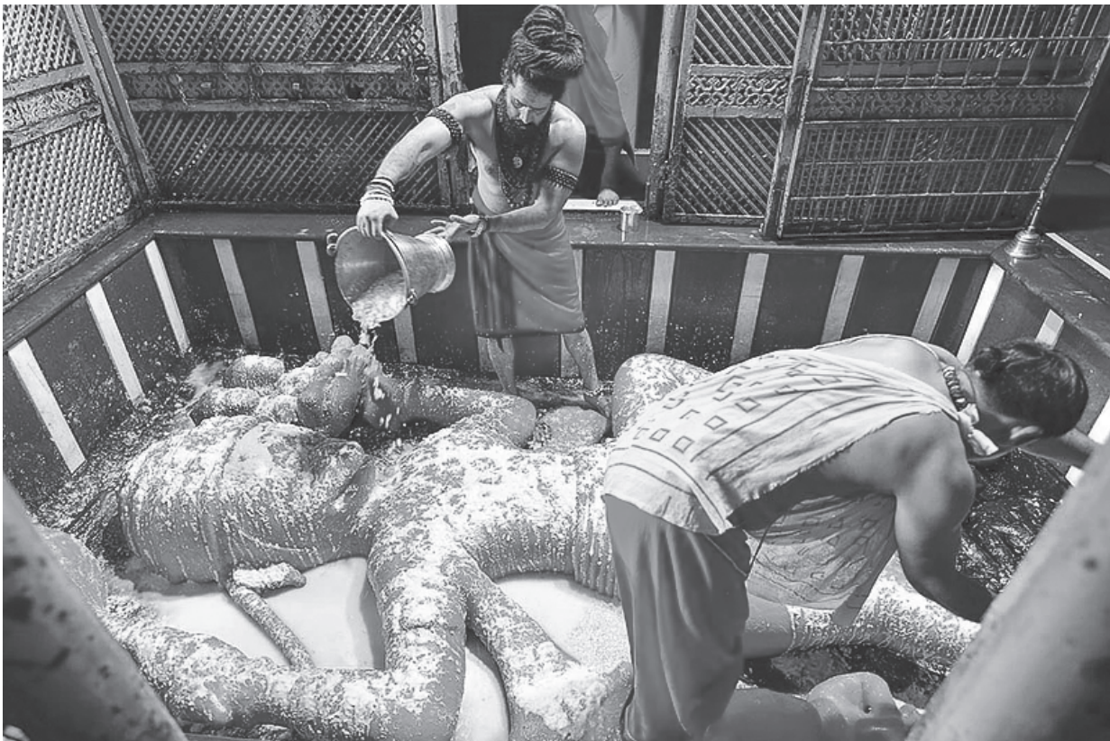
Priests perform 'abhishek' at the Bade Hanuman Mandir during the Monsoon season, in Prayagraj on Tuesday.