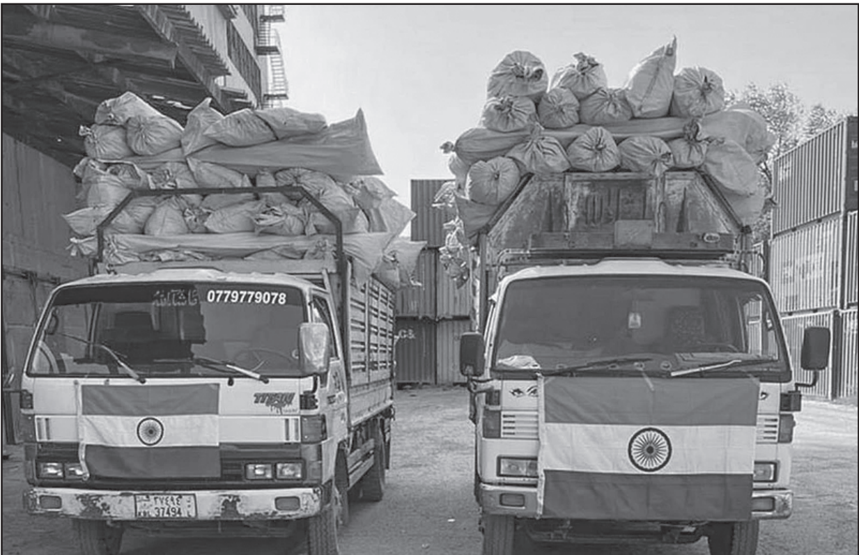
Trucks carrying Indian aid to earthquake-hit Afghanistan.

The measure, laid out in an Aug. 18 cable from the State Department to U.S. embassies and consulates, marks a sweeping extension of earlier measures that applied only to residents of Gaza. The new policy now targets Palestinians in the West Bank and across the diaspora. Earlier this month, the Trump administration also revoked visas from members of the Palestine Liberation Organization and the Palestinian Authority, preventing them from attending the upcoming United Nations General Assembly in New York.