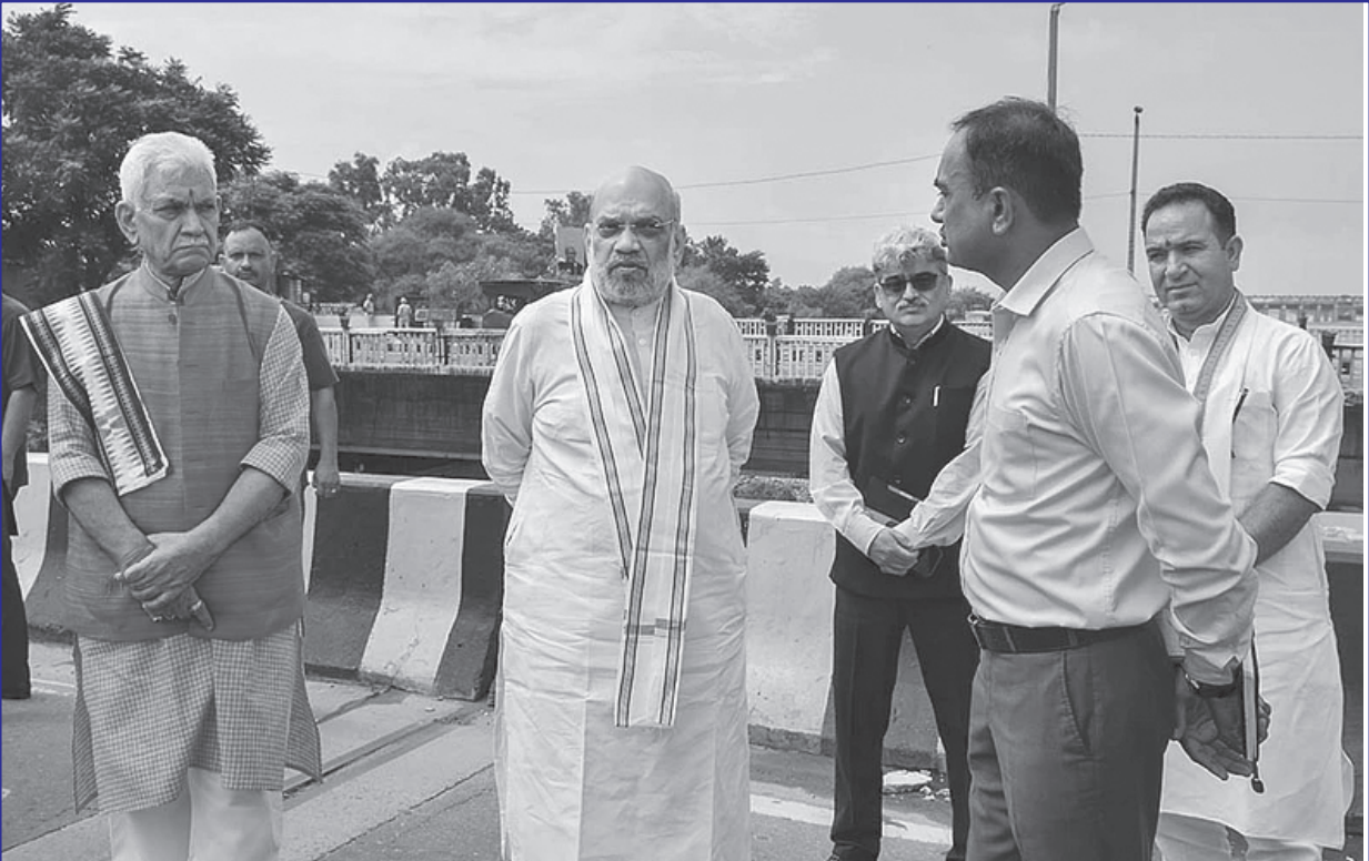
Union Home Minister Amit Shah with J&K LG Manoj Sinha during a visit at flood-affected areas, near Tawi Bridge at Bikram Chowk, in Jammu.

Reports indicate that the boycott stemmed from tensions after compensation agreed with the deceased worker's family was not paid, prompting protests by Dalits in the village.