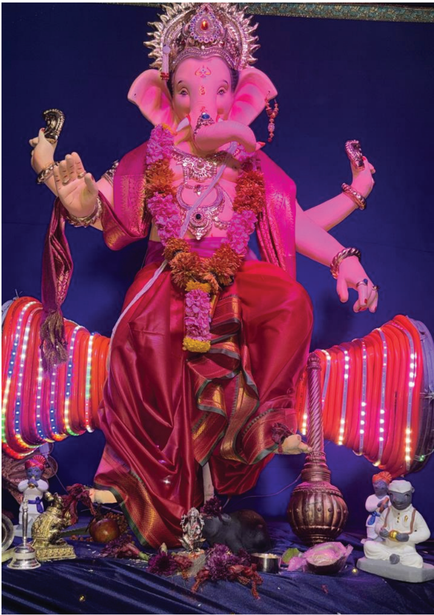
Shyam Sitaram Satvidkar (Murud Janjira ekdara)