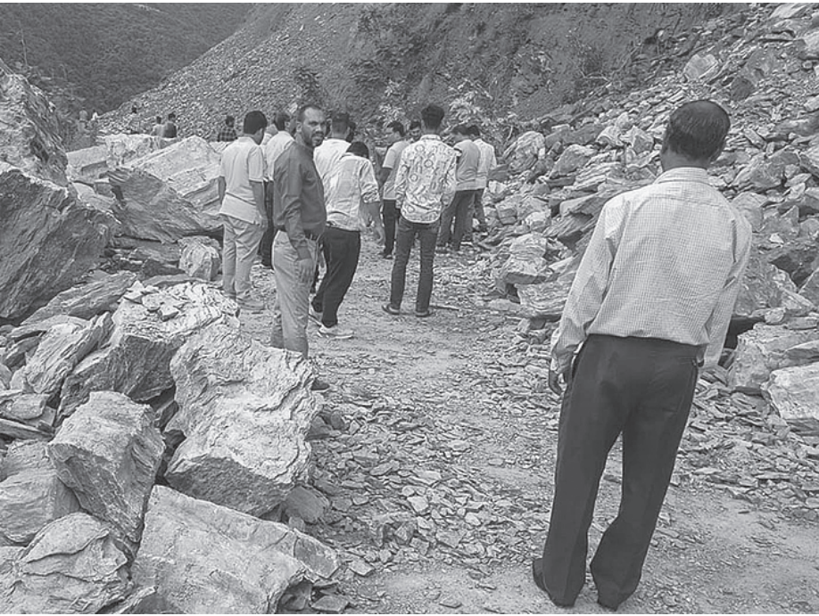
People make their way through debris blocking the Rishikesh-Devprayag road following a landslide, near Mulya Gaon in Tehri Garhwal district, Uttarakhand on Thursday.