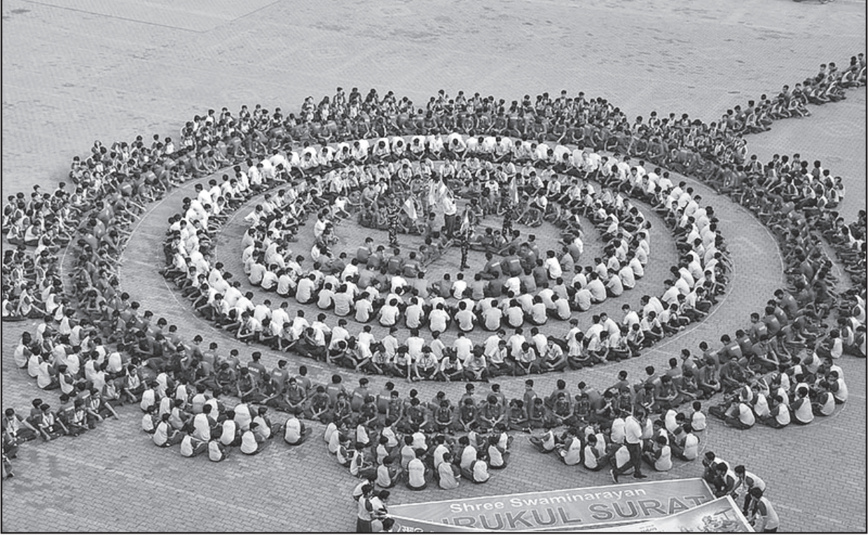
Students form a concentric 'Rakhi' formation as part of celebrations ahead of 'Raksha Bandhan' festival, at Shree Swaminarayan Gurukul in Surat on Thursday.

He also charged Prime Minister Narendra Modi with a foreign policy failure after the Donald Trump administration imposed a 50 percent tariff on Indian goods exported to the USA.