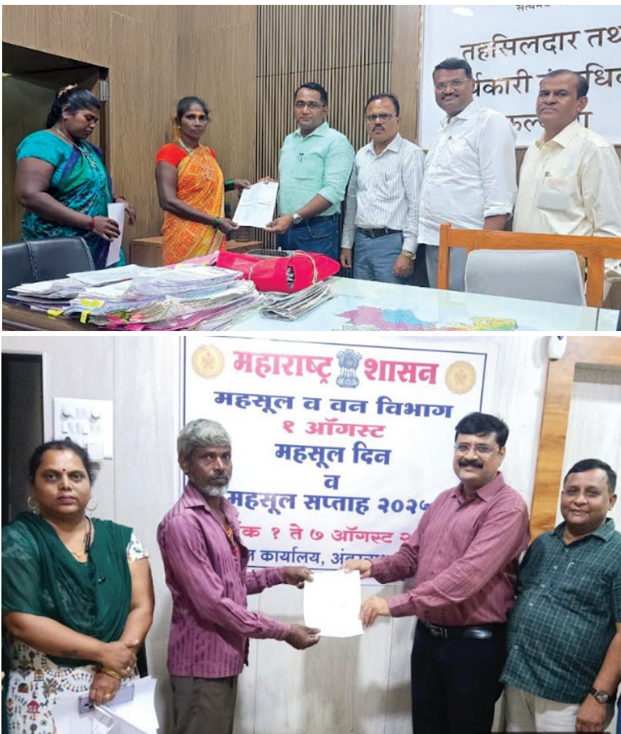
seminar, detailed Sand policy was given, the implementation of information about the M- which will help in facilitating this policy.

Also, an online seminar was organized for all the revenue officers, employees, crusher owners, mining lease holders and common citizens of the district to implement the M-Sand artificial sand policy in the state and complete the policy as per the new standard operating procedure. In this