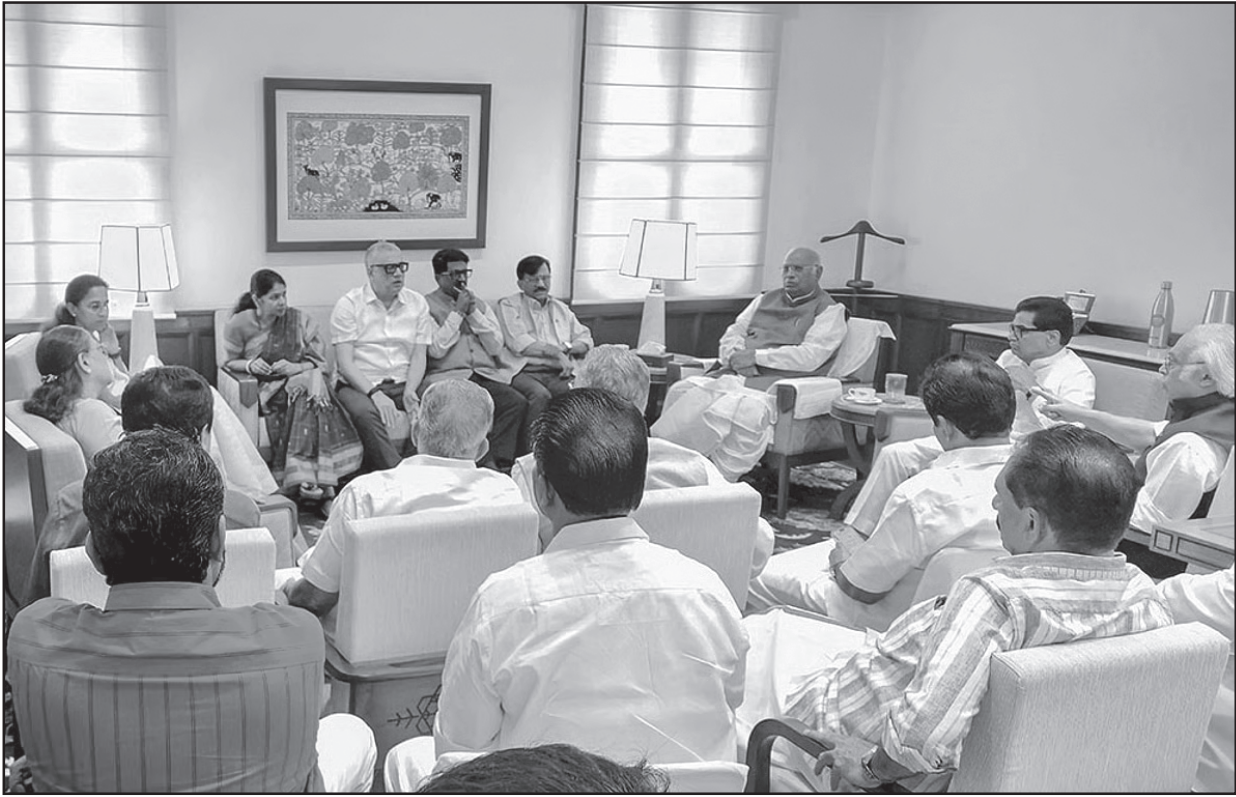
Leader of Opposition in the Rajya Sabha and Congress President Mallikarjun Kharge with other leaders during a meeting of the floor leaders of the INDIA bloc, at Parliament House, in New Delhi on Wednesday.