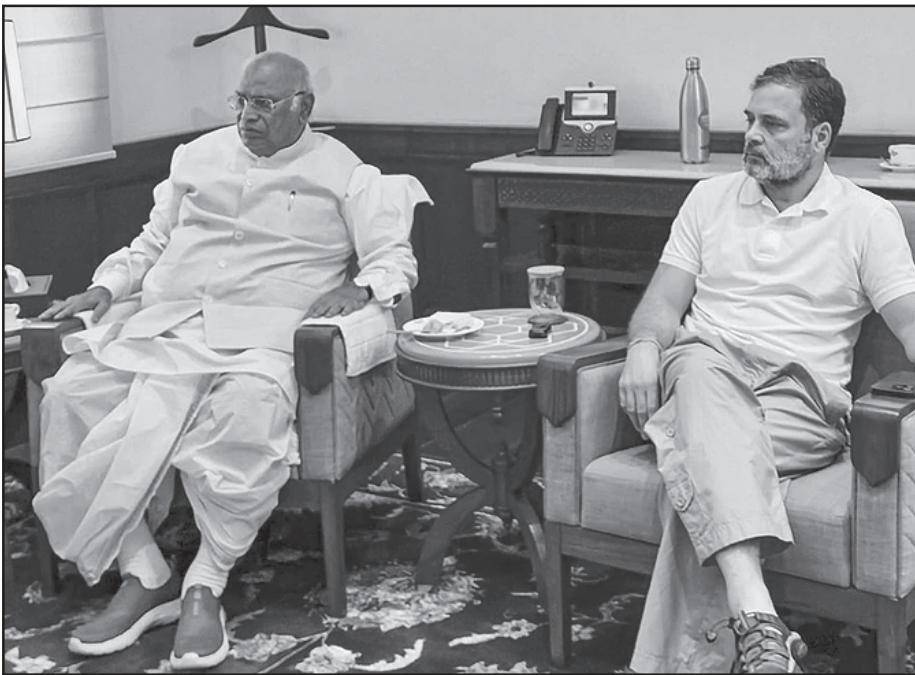
In this image, Congress President Mallikarjun Kharge and LoP in the Lok Sabha and party leader Rahul Gandhi during a meeting of the floor leaders of the INDIA alliance, in New Delhi on Tuesday.

A massive cloudburst hit Dharali village in Uttarakhand's Uttarkashi district on Tuesday afternoon, triggering flash floods and landslides that led to the collapse of several houses and hotels. The calamity has caused widespread devastation, with several people reported missing and rescue operations currently underway.