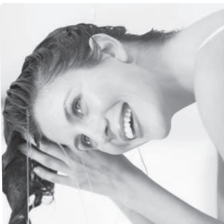
wash your hair. Methi is effective for many hair

Apply lemon juice on your scalp for 15 minutes and then wash it off. This will ensure an oil-free scalp. Soak fenugreek (methi) seeds in water overnight. Strain the water the next day and use this water to