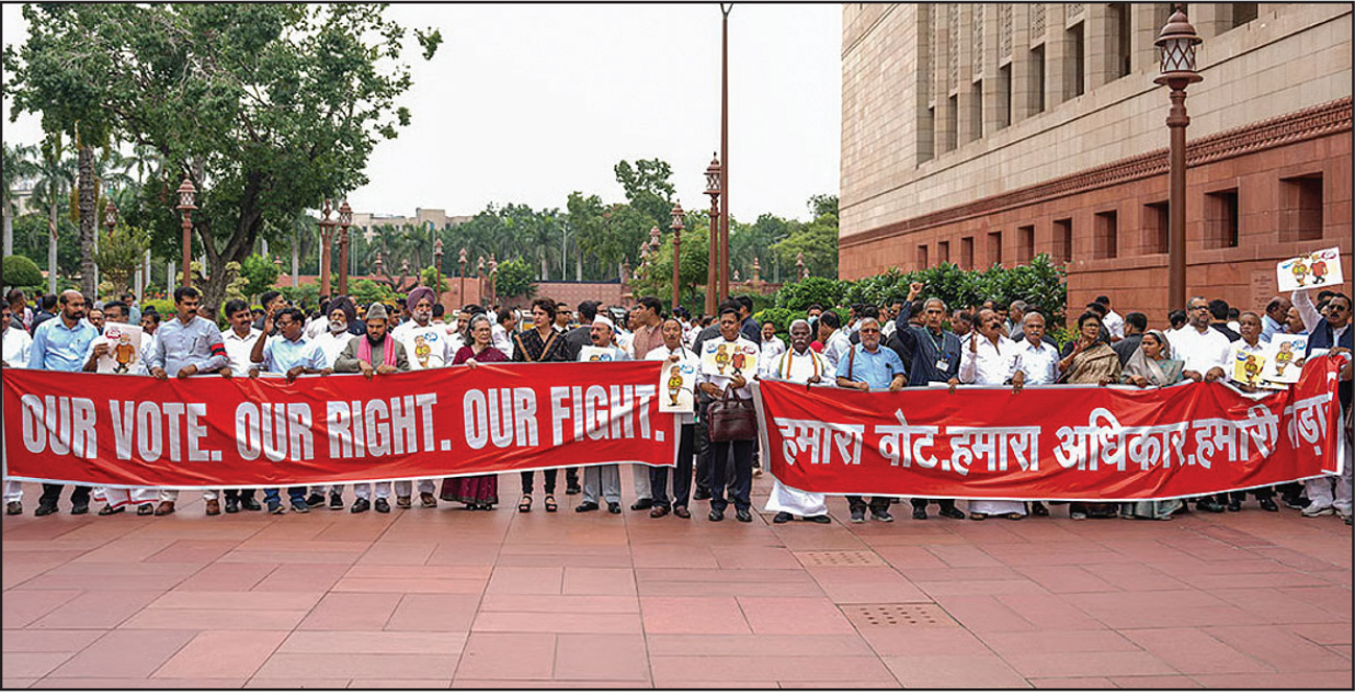
Congress MPs Sonia Gandhi and Priyanka Gandhi Vadra with other parliamentarians of the INDIA bloc parties stage a protest against the Election Commission's Special Intensive Revision (SIR) of electoral rolls in Bihar, during the Monsoon session of Parliament, in New Delhi on Tuesday.