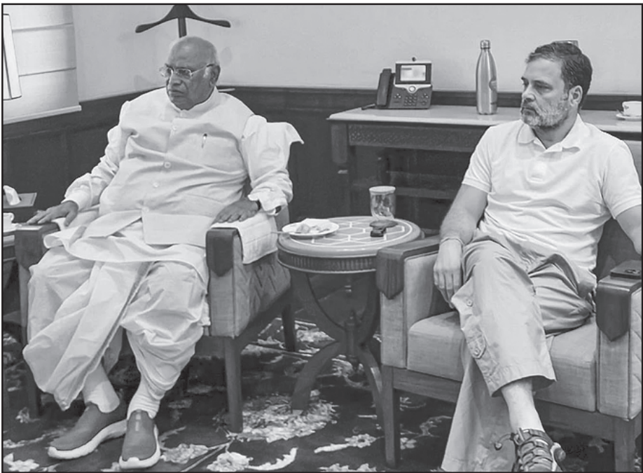
Congress President Mallikarjun Kharge and LoP in the Lok Sabha and party leader Rahul Gandhi during a meeting of the floor leaders of the INDIA alliance, in New Delhi on Tuesday.

A massive cloudburst hit Dharali village in Uttarakhand's Uttarkashi district on Tuesday afternoon, triggering flash floods and landslides that led to the collapse of several houses and hotels. The calamity has caused widespread devastation, with several people reported missing and rescue operations currently underway.