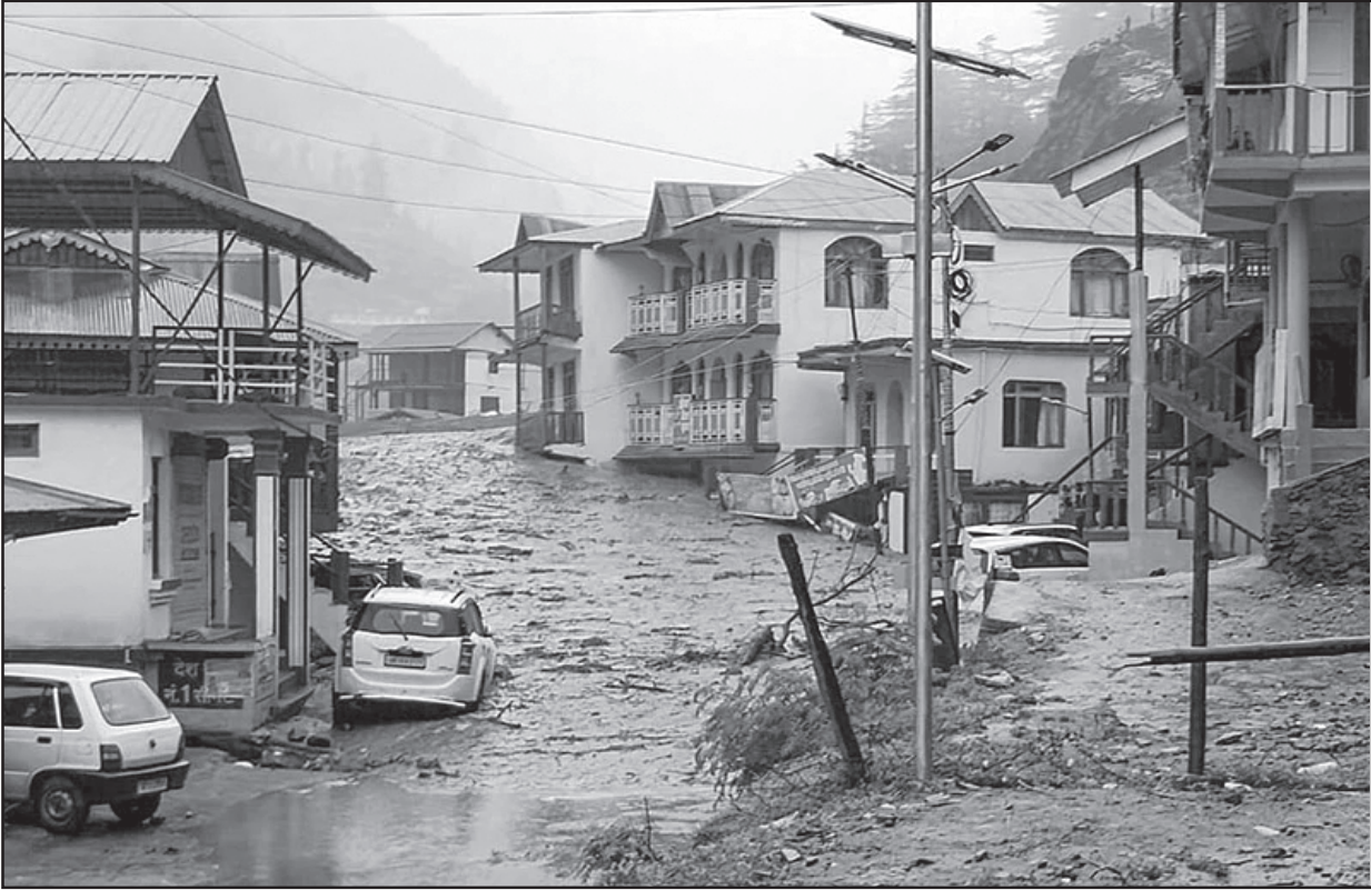
Houses and other structures being swept away in a flash flood triggered by a cloudburst at Dharali, in Uttarkashi district, Uttarakhand on Tuesday.