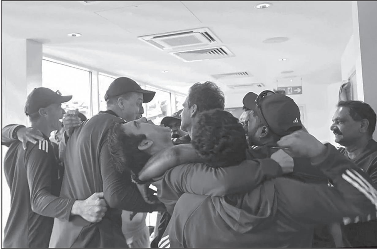
In this screenshot from @BCCI via X, India's head coach Gautam Gambhir with staff members celebrates after the team won the fifth Test cricket match against England, at The Oval, in London.