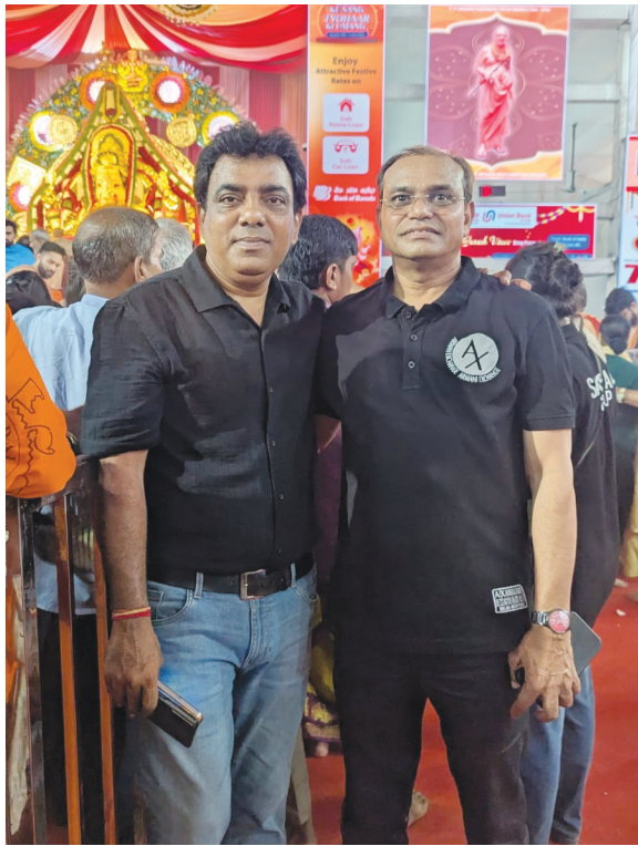
Mumbai GSB Seva mandal is the richest ganpati mandal this year ganpati idol with 66kg if gold and 336kg of silver ornaments plus insurance cover of 474 crore.