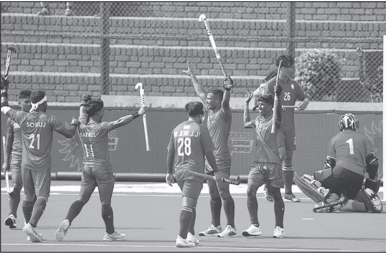
Bangladesh's players celebrate after scoring a goal during the Men's Hockey Asia Cup 2025 match between Chinese Taipei and Bangladesh, in Rajgir, Bihar on Saturday.

Meanwhile, the women’s draw remains loaded with star power, with defending champion Iga Swiatek scheduled for action later in the evening. But for the moment, it was Gauff’s dominant showing that set the tone for Day 7.