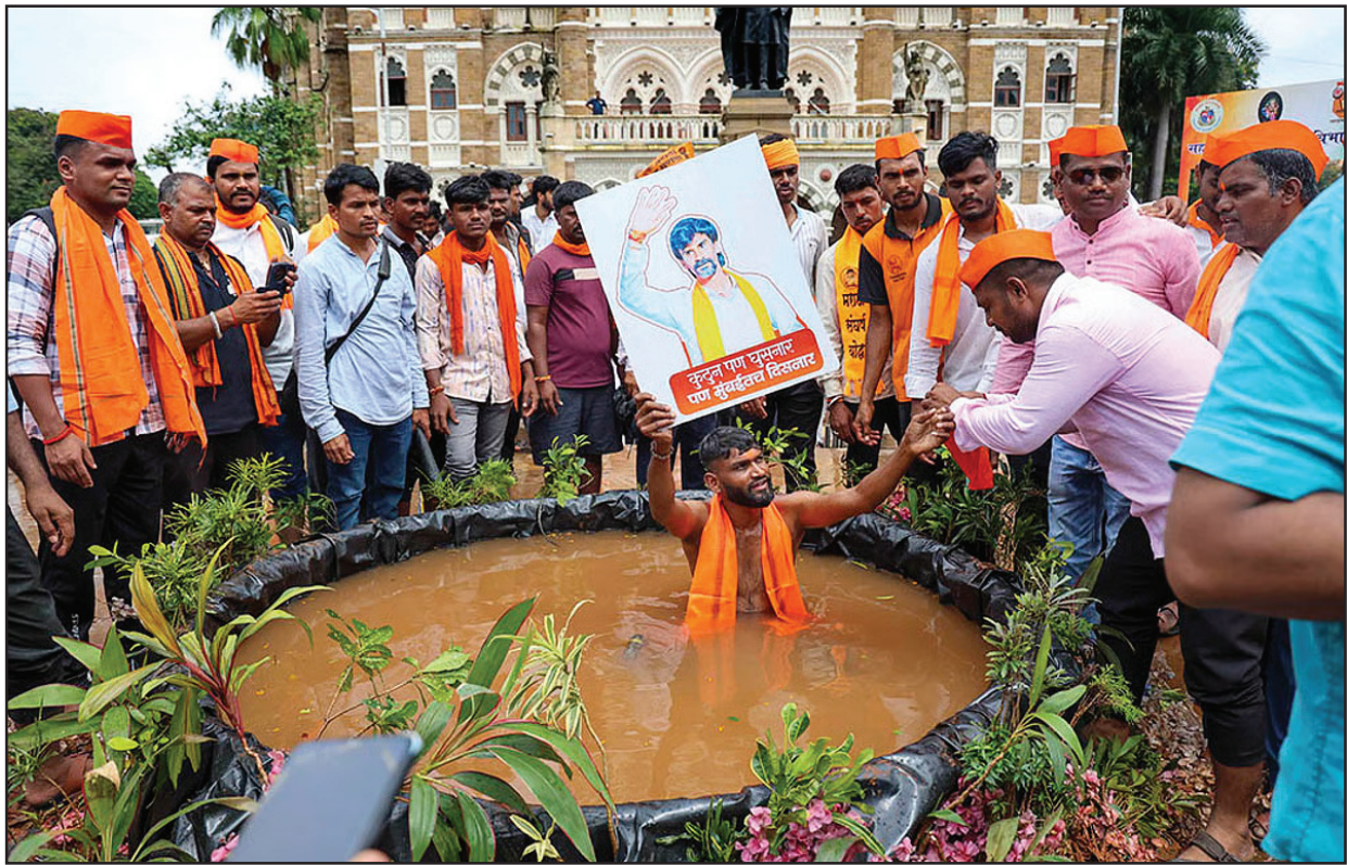
Supporters of activist Manoj Jarange Patil, who is on hunger strike demanding Maratha reservation, gather outside Chhatrapati Shivaji Maharaj Terminus to join his agitation, in Mumbai on Saturday.

polls are expected soon, and BJP along with the Shiv Sena (Shinde faction) is determined to wrest control of the BMC from the Shiv Sena (Uddhav Thackeray faction), which has dominated the corporation for over two decades. Against this backdrop, the BJP formally launched its election campaign, using Shah's Mumbai tour as the occasion.