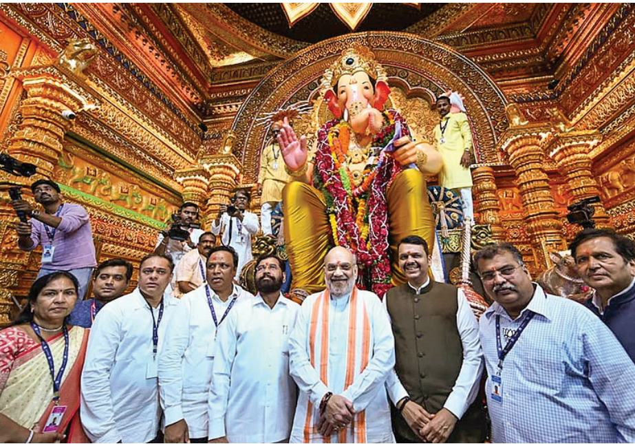
Union Home Minister Amit Shah along with Maharashtra Chief Minister Devendra Fadnavis and Deputy Chief Minister Eknath Shinde visits the pandal of 'Lalbaugcha Raja' idol of Lord Ganesha, in Mumbai on Saturday.

Shah, along with his family, visits the Lalbaug cha Raja every year. Shah held a meeting