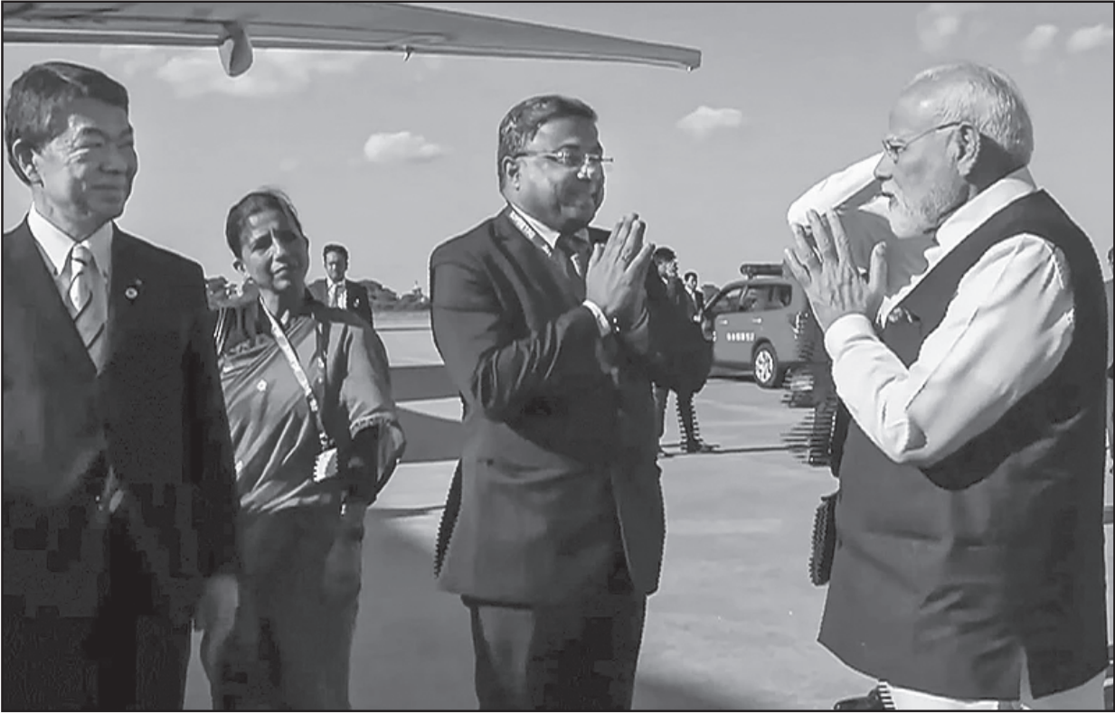
Prime Minister Narendra Modi being greeted by officials as he emplanes for China after concluding his visit to Japan.

The government had promised to close asylum hotels by the time of the next general election. Britain and France are trialing a scheme to send migrants arriving on small boats across the English Channel back to France in exchange for the same number of asylum seekers being brought to Britain on a legal route. But the numbers involved in this scheme are likely to represent only a small fraction of those who arrive.