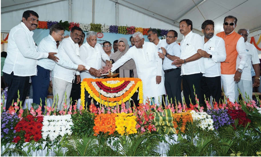
(Standard Post Bureau)

Bengaluru, Aug 30 : Mr V. Somanna, Union Minister of State for Railways and Jal Shakti, laid the foundation stone for the construction of a Light Road Over Bridge (ROB) at Gubbi Railway Station, Tumakuru district today. The project has been sanctioned at an estimated cost of Rs 20 crore.