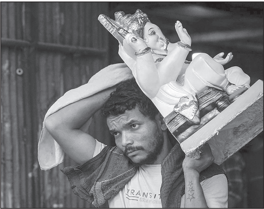
A man carries an idol of Lord Ganesh on the eve of the ‘Ganesh Chaturthi’ festival, in Bengaluru on Tuesday.

The museum will also document the histories of tribes including Gond, Madia, Kolam, Halba, and