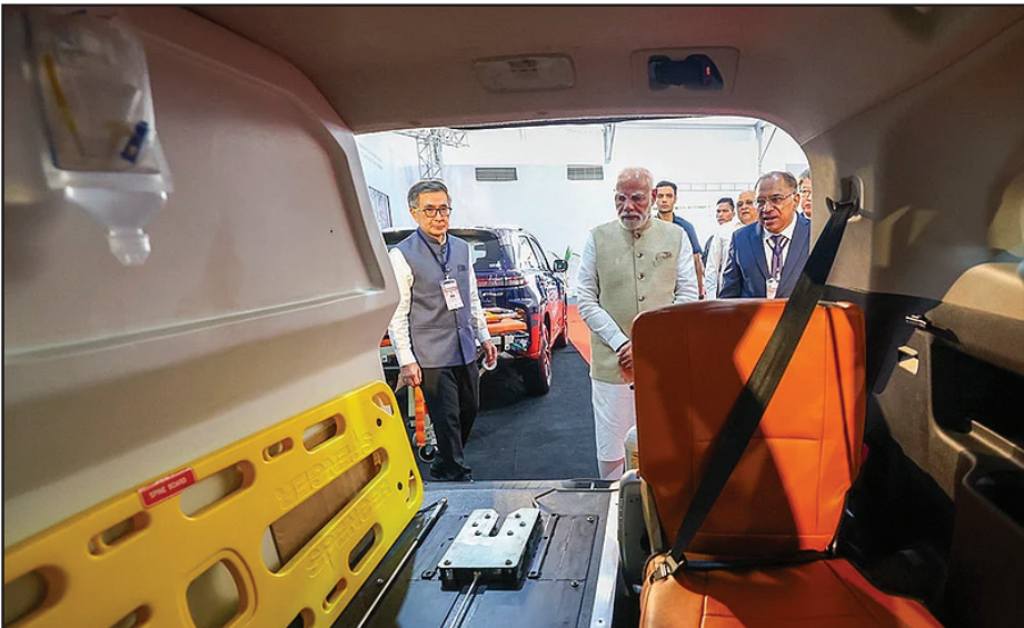
Prime Minister Narendra Modi with President of Suzuki Motors Toshihiro Suzuki during a visit at Maruti Suzuki's Hansalpur manufacturing facility, in Ahmedabad on Tuesday.