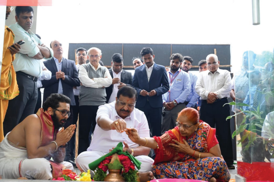
(Standard Post Bureau) Bidar, Aug 26 : A renovated Hi-Tech Honda

showroom near Fateh Darwaza in the city was inaugurated on Tuesday.