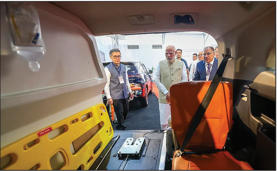
Prime Minister Narendra Modi with President of Suzuki Motors Toshihiro Suzuki during a visit at Maruti Suzuki's Hansalpur manufacturing facility, in Ahmedabad on Tuesday.

New Delhi, Aug 26 (UNI) : A day before US Tariffs against India are to come into force, Prime Minister Narendra Modi announced that Electric Vehicles (EVs) made in India will be exported to 100 countries from today, starting a new journey ‘Make in India, Make for the World.’ Coinciding with Ganeshotsav beginning tomorrow, the Prime Minister said “a new chapter is being added to India’s ‘Make in India’ journey. This ‘Make in India, Make for the World’ is a big