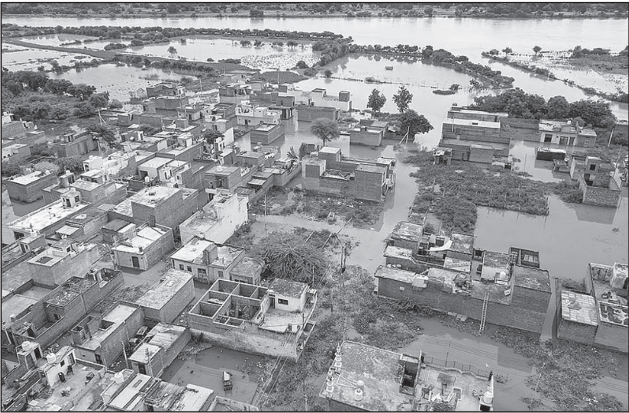
A view of partially submerged houses as the water level of the Yamuna river rises following heavy rainfall, in Mathura.

Kolhapur, Aug 20 (UNI) Police today seized a large quantity of gutka worth Rs 62.45 lakh from a truck on the Pune-Bengaluru national highway here and arrested two people in this connection.Acting on a tip-off, a joint team of police from Ichalkaranji, Jaysingpur and Vadgan intercepted a truck at the Kini toll plaza and found 176 bags of Vimal Pan Masala gutka inside.They seized gutka worth Rs 62,45,360 and the truck used for transportation worth Rs 15 lakh. The total value of the seizure is Rs 77.45 lakh. They arrested two men in this connection. They were identified as Shahzad Mahamad Murban Khan (40) and Rizwan Ahamad Khan alias Raza (32), both hailing from Uttar Pradesh.