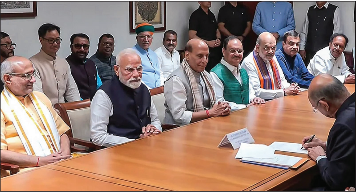
Governor and NDA’s candidate CP Radhakrishnan exchanges a wam handshake with Prime Minister Narendra Modi as he files nomination papers for vice presidential election, in New Delhi. Defence Minister Rajnath Singh looks on.

New Delhi. Aug 20 (UNI) : The National Democratic Alliance (NDA) seems poised to win the Vice President’s election scheduled for September 9, in view of the majority of its Members in both Lok Sabha and Rajya Sabha.