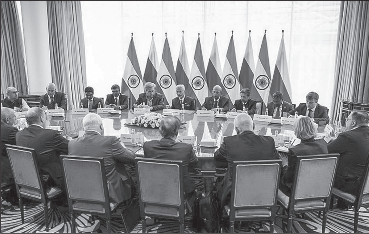
External Affairs Minister S Jaishankar interacts with prominent scholars and think tank representatives of Russia, in Moscow on Wednesday.

Since his second term, Trump has extended the deadline twice, each by 75 days on Jan. 20 and April 4, respectively. On June 19, Trump signed an executive order to keep TikTok running in the United States for another 90 days, extending the deadline to Sept. 17, 2025.