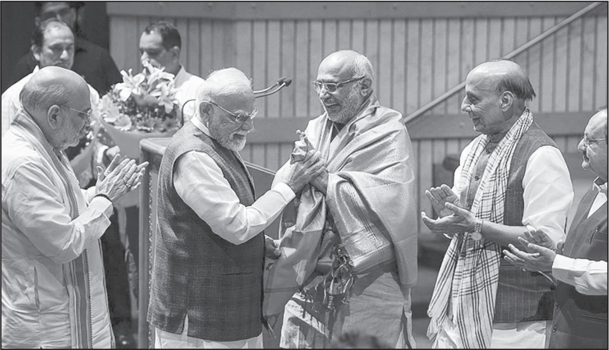
Prime Minister Narendra Modi felicitates Maharashtra Governor and NDA's vice presidential candidate C.P. Radhakrishnan as Defence Minister Rajnath Singh, Union Home Minister Amit Shah, and Union Minister and BJP National President J.P. Nadda applaud during the NDA parliamentary party meeting, in New Delhi on Tuesday.

The Opposition India bloc is yet to announce its candidate. The vice-presidential election is scheduled to take place soon, with Radhakrishnan expected to file his nomination papers tomorrow.