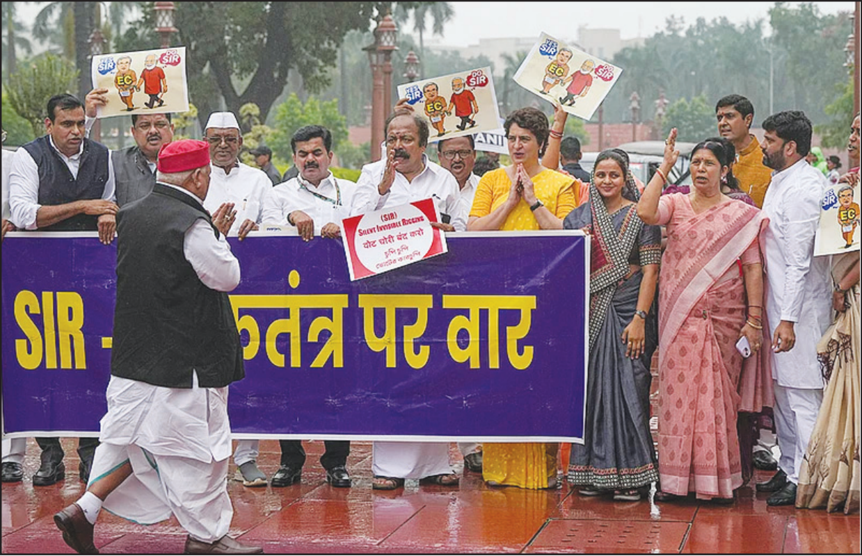
LoP in the Lok Sabha and Congress leader Rahul Gandhi with party MP Priyanka Gandhi Vadra during the Monsoon session of Parliament, in New Delhi on Thursday.

In recognition of his outstanding service to the nation, the General Officer has been decorated with the Param Vishisht Seva Medal, Ati Vishisht Seva Medal, Sena Medal, and Vishisht Seva Medal.