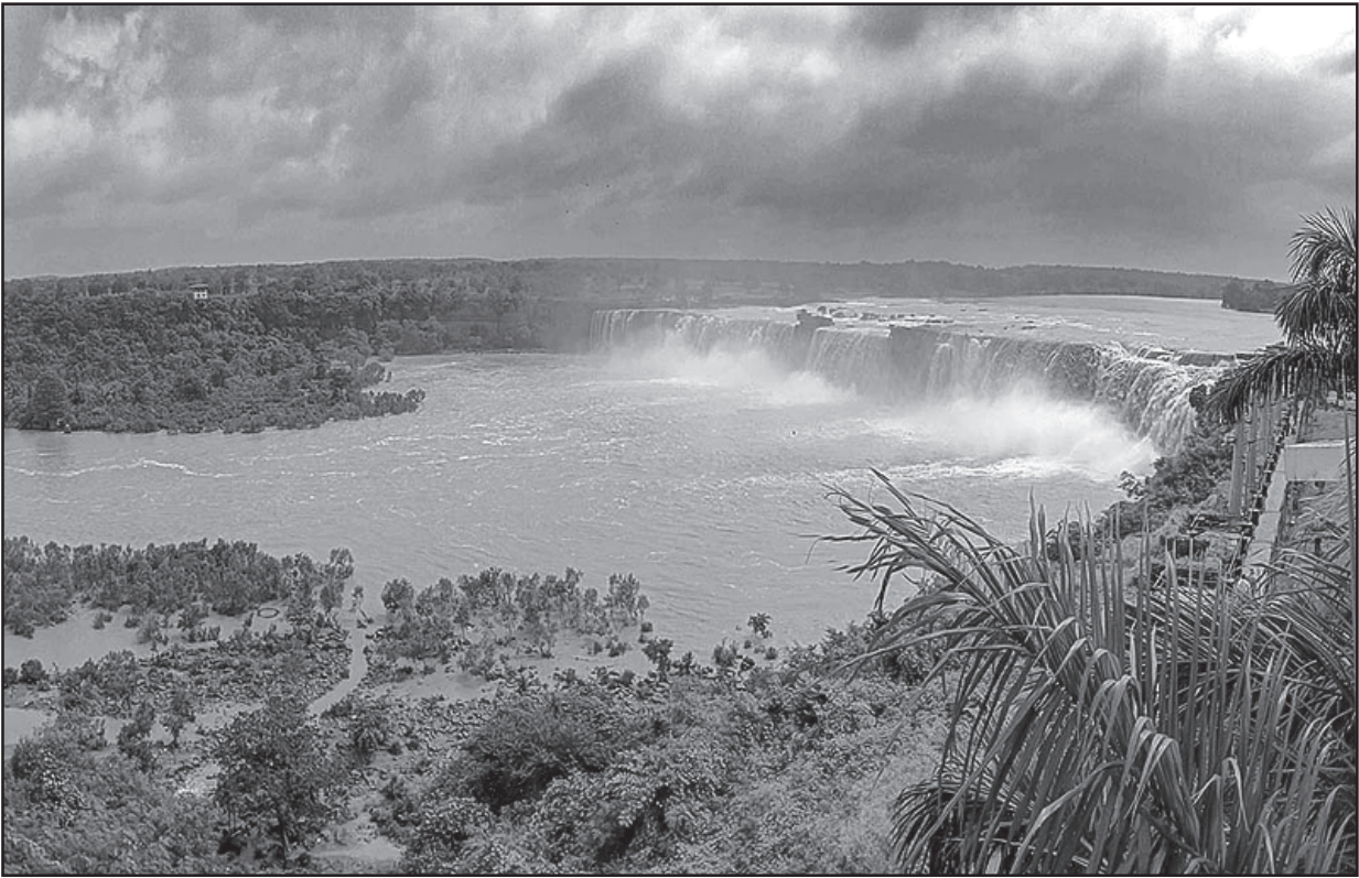
The Indravati river flows in spate after rainfall, at Chitrakote waterfall, in Bastar district, Chhattisgarh on Thursday.

The padayatra will commence at 1700 hours from Parigi in Rangareddy district and will continue for four days, culminating in Khanapur on August 4.AICC in-charge Meenakshi Natarajan will join Mahesh Kumar Goud in the inaugural phase of the walkathon, which is aimed at taking the development and welfare initiatives of the Congress government under Chief Minister A. Revanth Reddy to the people.The program also seeks to strengthen the party organisation and gear up for the upcoming local body elections.The starting point of the padayatra has been decked up with cutouts and flex banners, and Congress workers are expected to participate in large numbers. The first phase of the “Janahita” Padayatra will cover the stretch from Parigi to Khanapur under the supervision of the TPCC.