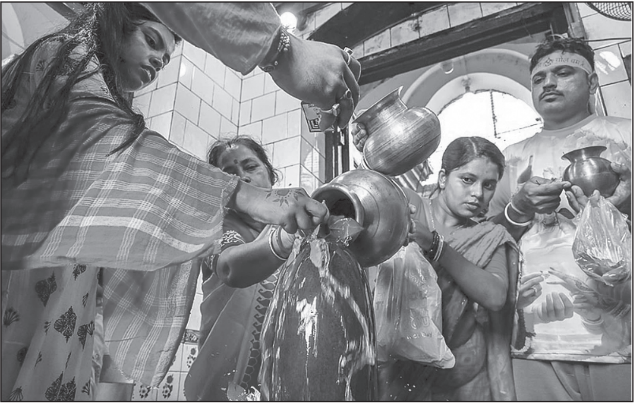
Devotees perform 'Jalabhishek' of a shivling at Shiv Bari temple, in Agartala on Monday.

OADG Nashik played a pivotal role in the successful absorption of Transfer of Technology for LCA manufacturing