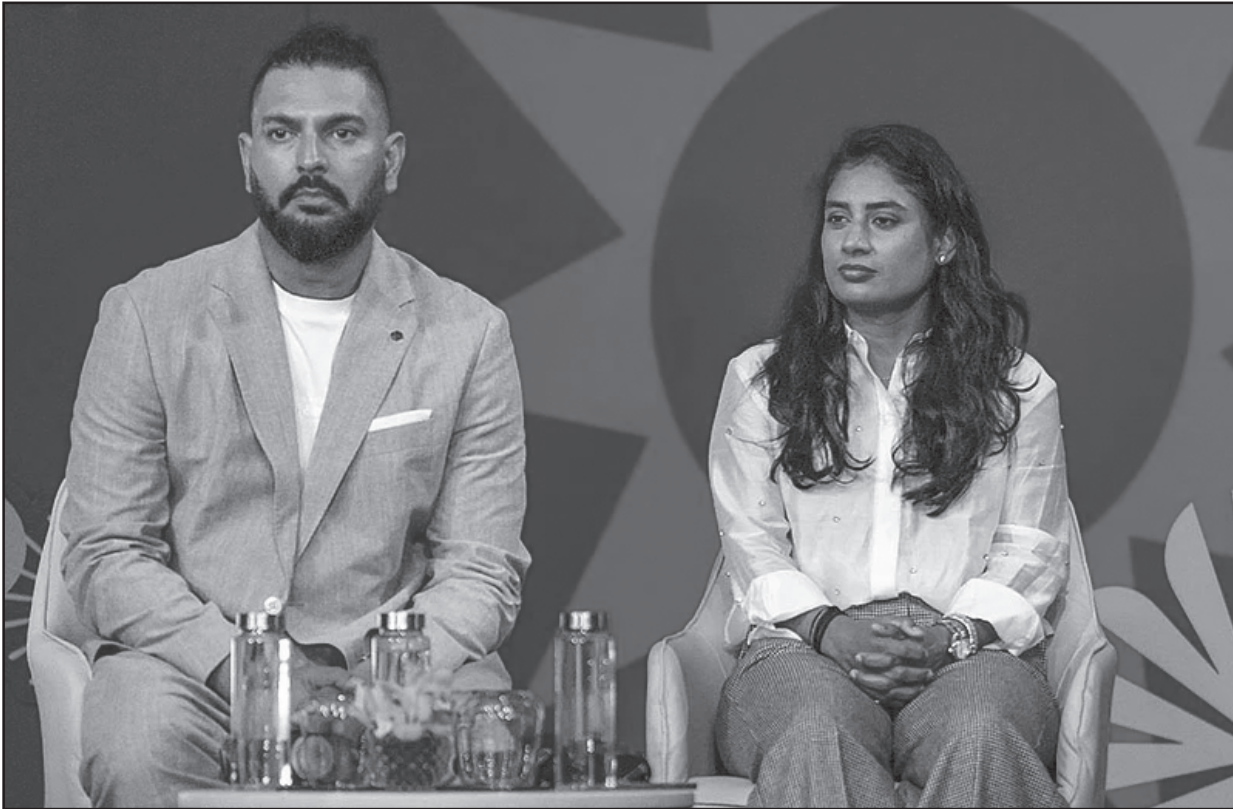
Former cricketers Mithali Raj and Yuvraj Singh during an event organised ahead of the ICC Women’s Cricket World Cup 2025, in Mumbai. The tournament will begin on Sept. 30, 2025.

"The trip to get here was long and the weather is very hot, but the organization and accommodation are the best I have experienced in my seven World Games appearances. China has done an excellent job hosting," he said.