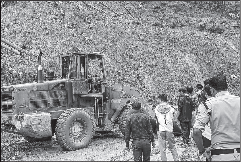
Debris being removed amid restoration work after the Gangotri highway was blocked or breached at several points due to flash floods and landslides triggered by a cloudburst, in Uttarkashi, Uttarakhand.