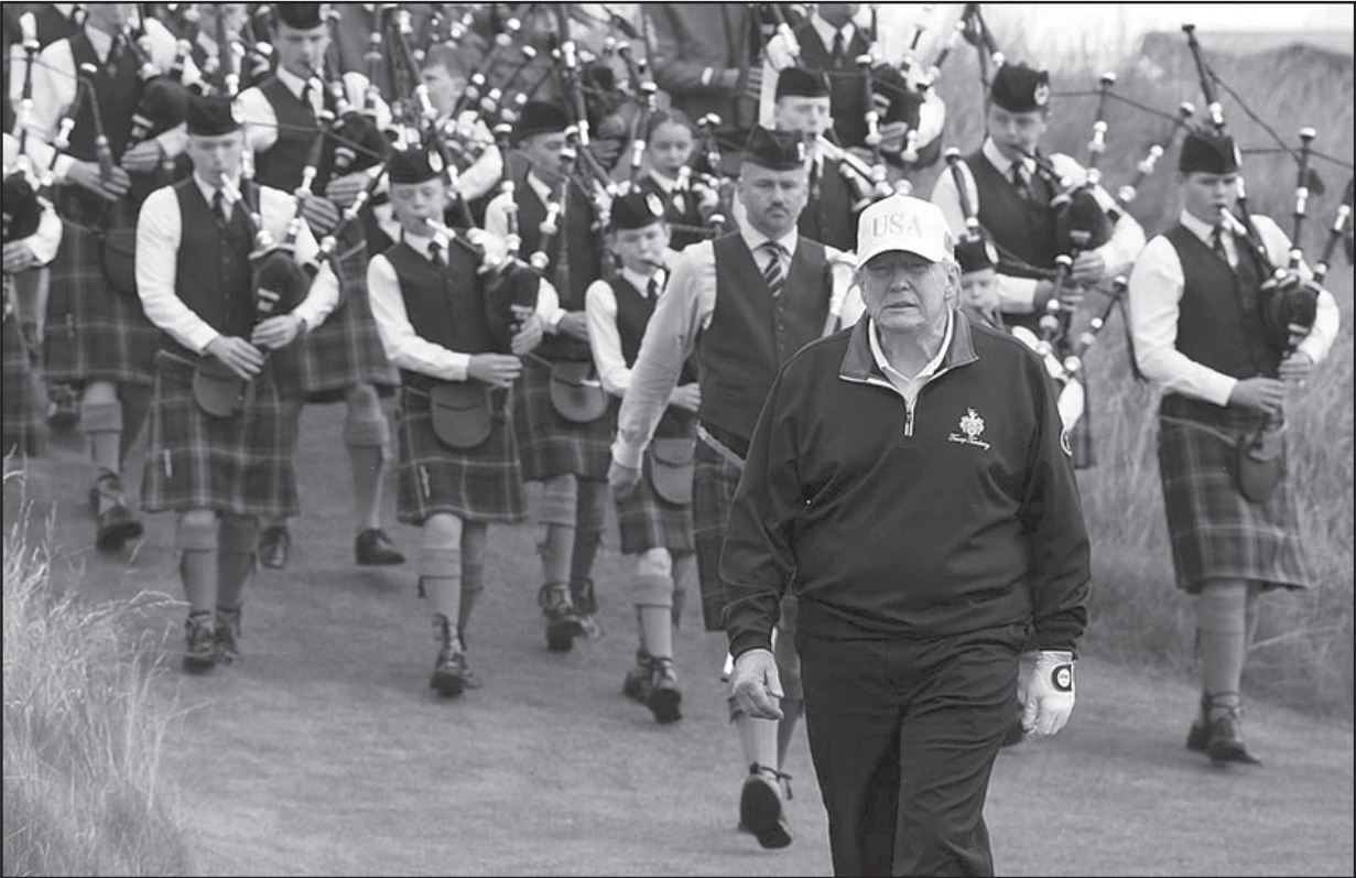
US President Donald Trump arrives, followed by a bagpiper band, at the opening ceremony for the Trump International Golf Links golf course, near Aberdeen, Scotland.

The Vietnamese government earlier announced that gasoline-powered motorbikes and mopeds will be banned from inner-city Hanoi from mid-2026 as part of efforts to reduce air pollution.