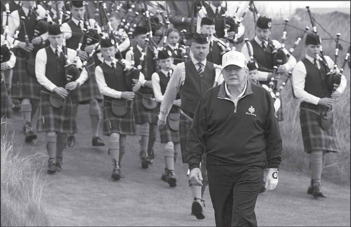
US President Donald Trump arrives, followed by a bagpipe band, at the opening ceremony for the Trump International Golf Links golf course, near Aberdeen, Scotland.

The Vietnamese government earlier announced that gasoline-powered motorbikes and mopeds will be banned from inner-city Hanoi from mid-2026 as part of efforts to reduce air pollution.