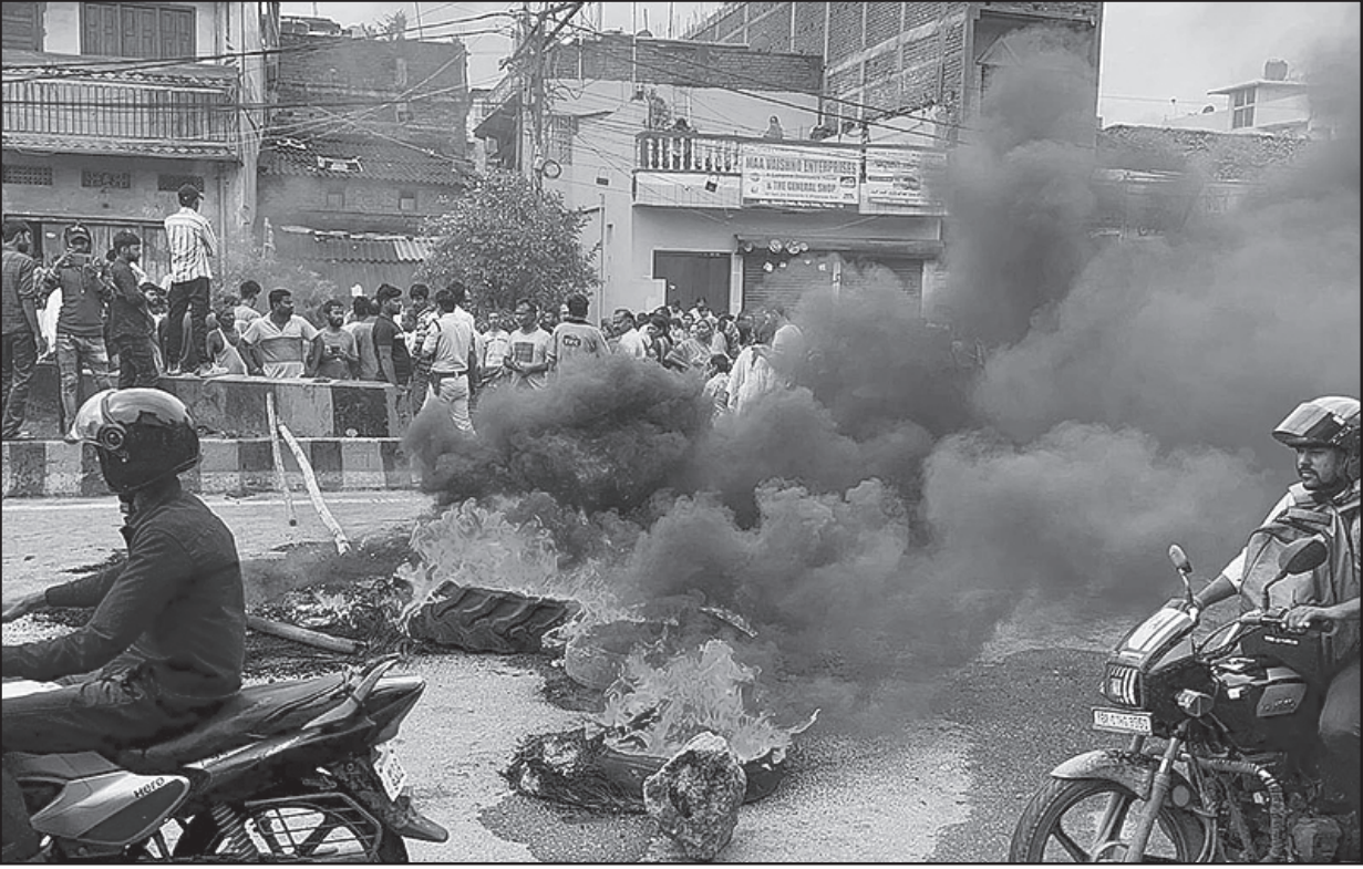
People gather after tyres being set on fire during a protest over a road accident, in Patna.

He said that by suspending the Indus Water Treaty (IWT) Prime Minister Modi had corrected the wrongs committed by former Prime Minister Jawaharlal Nehru. "Blood and water will not flow together," he said, providing reasons for India's decision to suspend the IWT. Dr Jaishankar recalled that during the Indus Waters Treaty, Nehru was more concerned about Pakistani farmers than Indian farmers. Nehru had stated in Lok Sabha that the water agreement would benefit farmers in West Punjab which was then part of Pakistan. Jaishankar also appreciated the role of Members of Parliament who were part of the all-party delegations sent to different countries to clarify India's position on Operation Sindoor.