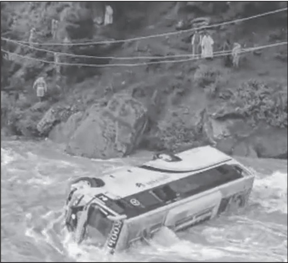
People gather after a bus with 31 army personnel overturned on the Badrinath Highway, in Chamoli. Seven army personnel were injured in the incident.