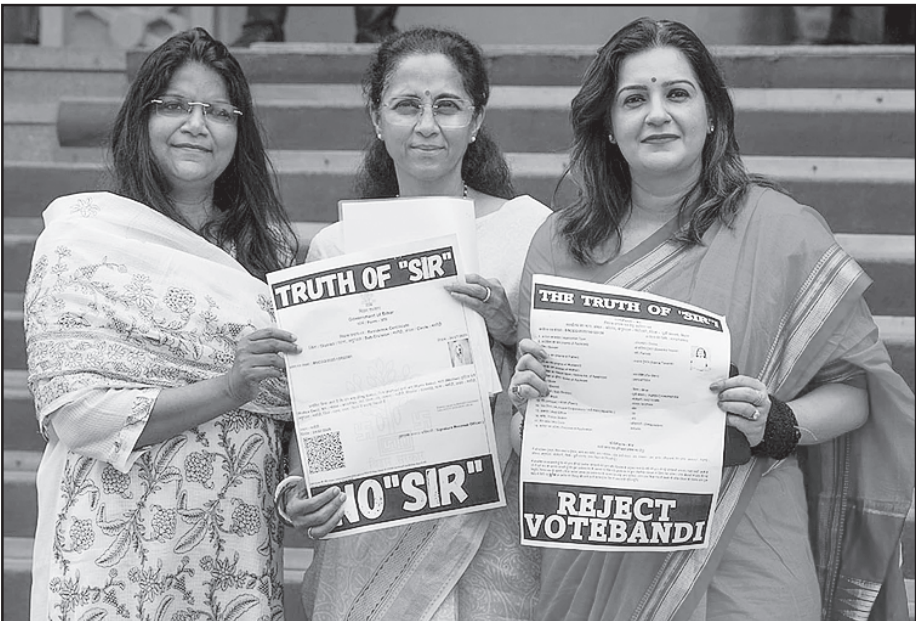
NCP (SP) MP Supriya Sule, center, Shiv Sena (UBT) MP Priyanka Chaturvedi, right, and others hold posters as they protest against the Election Commission's Special Intensive Revision (SIR) of electoral rolls in Bihar, during the Monsoon session of Parliament, in New Delhi on Wednesday.

The state clarified that there is no legal provision to grant free and permanent homes to the retired or serving government employees. Additionally, implementing such a policy can set a precedent, leading other government employees living in official quarters across the state to demand similar benefits. This, in turn, can affect the availability of government housing for newly recruited officers and staff.