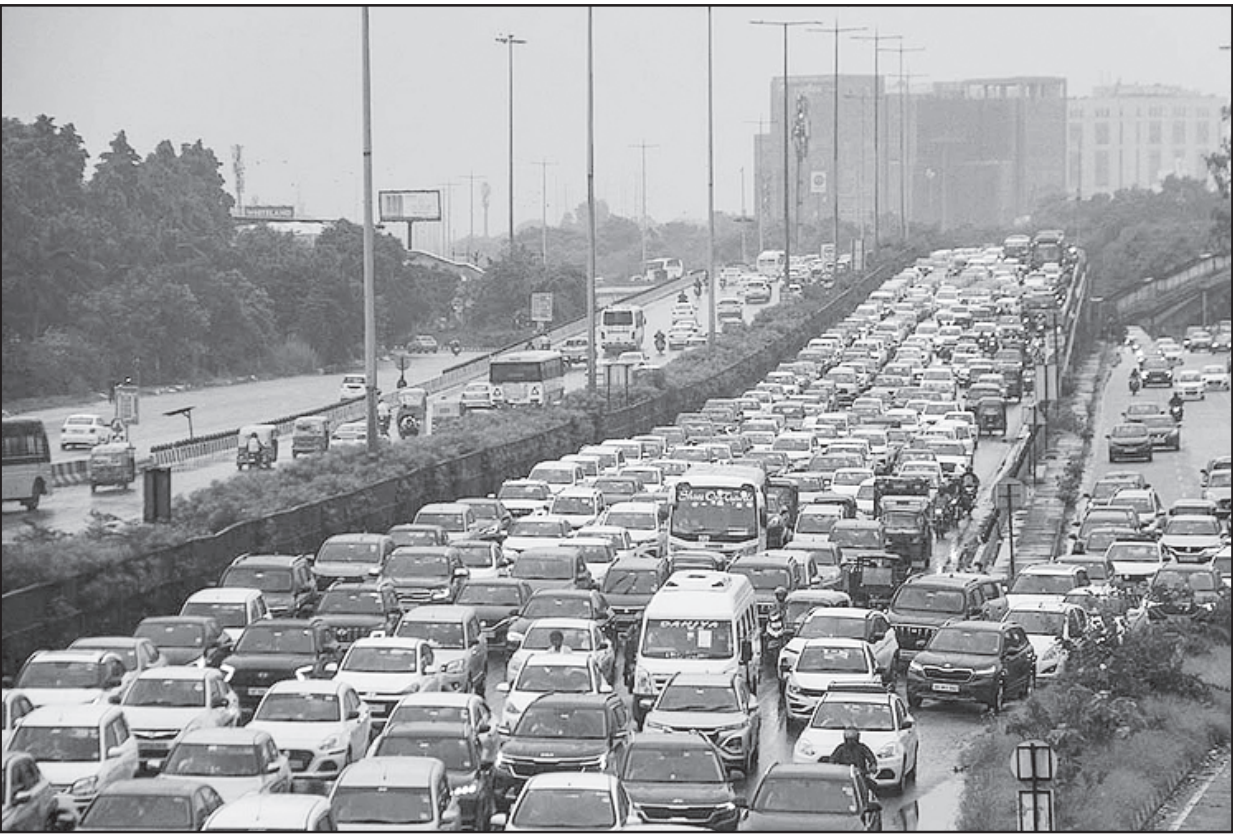
Vehicles stuck in a traffic jam on the Delhi-Gurugram Expressway following rainfall, near Signature Tower, in Gurugram.