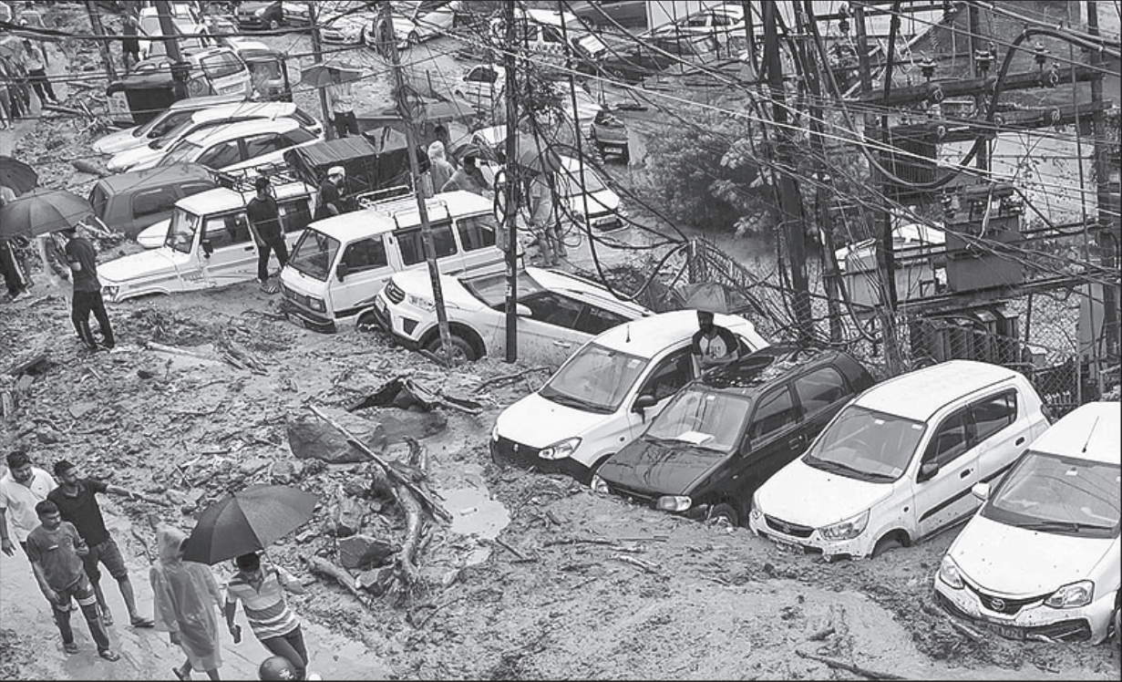
Vehicles stuck in the debris following flash floods triggered by heavy rainfall, in Mandi, Himachal Pradesh on Tuesday.

pieces of evidence. From this, we have concluded that the story narrated by the woman is baseless,” a senior police officer told the media. The incident has triggered a political controversy as Leader of the Opposition Suwendu Adhikari announced that an FIR would be filed against Chief Minister Mamata Banerjee, citing the Delhi Police’s version of events.“I have asked Soumendu (his brother and BJP MP from Kanthi) to file a police complaint,” Adhikari said in a press conference today. Taking a swipe at the Chief Minister, he added, “She is spreading false information. She could easily win an international award for spreading rumours.”Later in the day, Soumendu Adhikari filed a formal complaint at Delhi’s Mandir Marg police station.