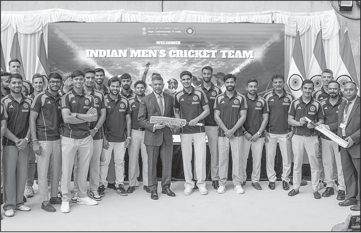
Indian Men's cricket team members during an event hosted by the High Commission of India in London.