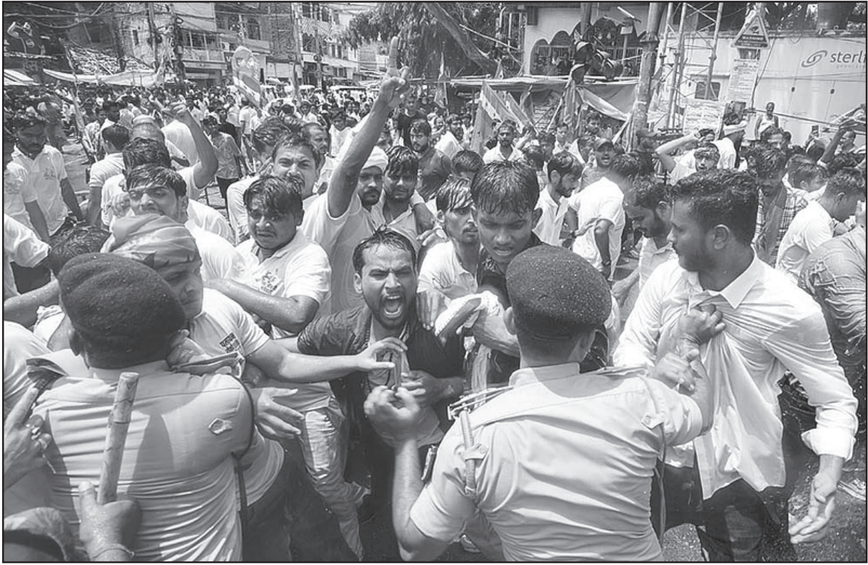
National Students' Union of India (NSUI) workers being stopped during a protest, in Patna on Wednesday.

products.CM observed that these fakes would damage the globally renowned brand of Kashmiri hand-made carpets and adversely affect the artisan families who depend on this craft for their livelihood.A delegation of Carpet Export Promotion Council, Indian Silk Export Promotion Council, Meeras Carpet Weavers Cooperative, the Kashmir Carpet Cluster Development Organisation