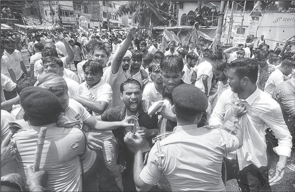
National Students' Union of India (NSUI) workers being stopped during a protest, in Patna on Wednesday.

The gallantry of the officers and residents has been lauded as an inspiring testament to unity and heroism.