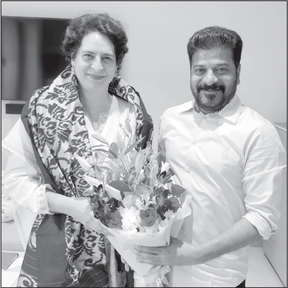
Met our inspiring leader Smt Priyanka Gandhi and gave her all details of the Telangana Caste Survey and the highlights of its findings by elangana Chief Minister Revanth Reddy in New Delhi on Thursday.