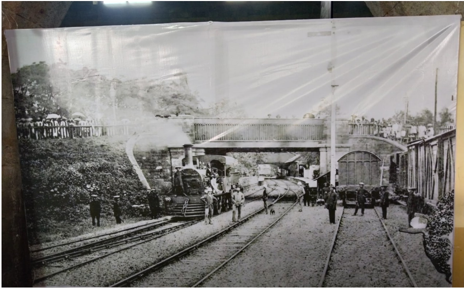
Photo of Old Byculla

The highlight of the exhibition was a GIPR monogram made of gun