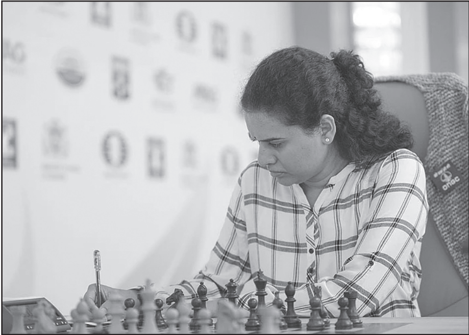
India's Koneru Humpy during semifinal chess match against China's Tingjie Lei at FIDE Women's World Cup 2025, in Batumi, Georgia.

Head coach Khalid Jamil will be eager to see his side rediscover that form and build on it as they aim for a stronger showing in the Durand Cup, having exited at the group stage last year.