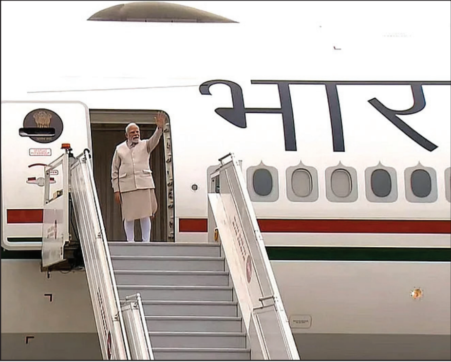
Prime Minister Narendra Modi greets as he emplanes for London, in New Delhi.

Mumbai July 23 (UNI) : A 20-year-old student from north India studying in neighbouring Navi Mumbai city was allegedly assaulted with a hockey stick by a group of people after he was asked to speak in Marathi, officials said here today. Police have registered a case against them, under Bharatiya Nyaya Sanhita (BNS) sections 118 (1) (voluntarily causing hurt or grievous hurt by dangerous weapons or means), 352 (intentional insult with intent to provoke breach of peace), 351(2) and 351(3) (criminal intimidation), section 3(5) (common intention) and others. According to the details, the incident occurred around 10.30 am on Tuesday outside a college in Vashi area of new Mumbai when accused persons had arguments with the student on some pittey matter later it turned into violent after they asked him to speak in marathi on his refusal they attacked him.