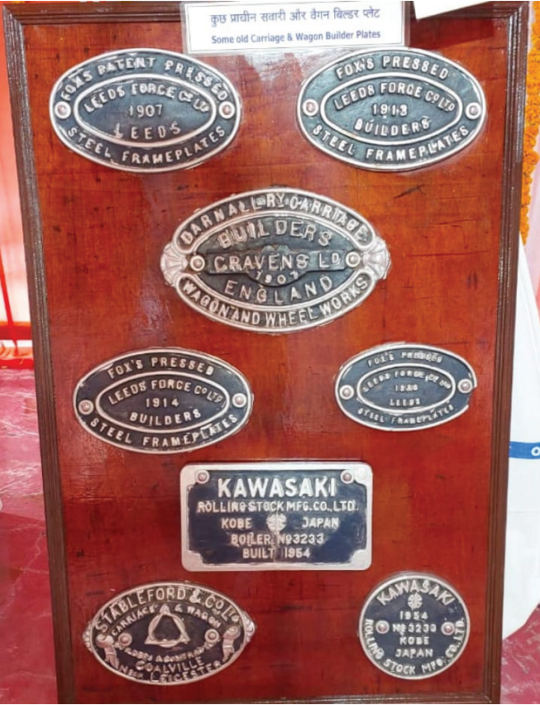
Old Carraige & Wagon badges

1891 is a fine example of Victorian architecture.