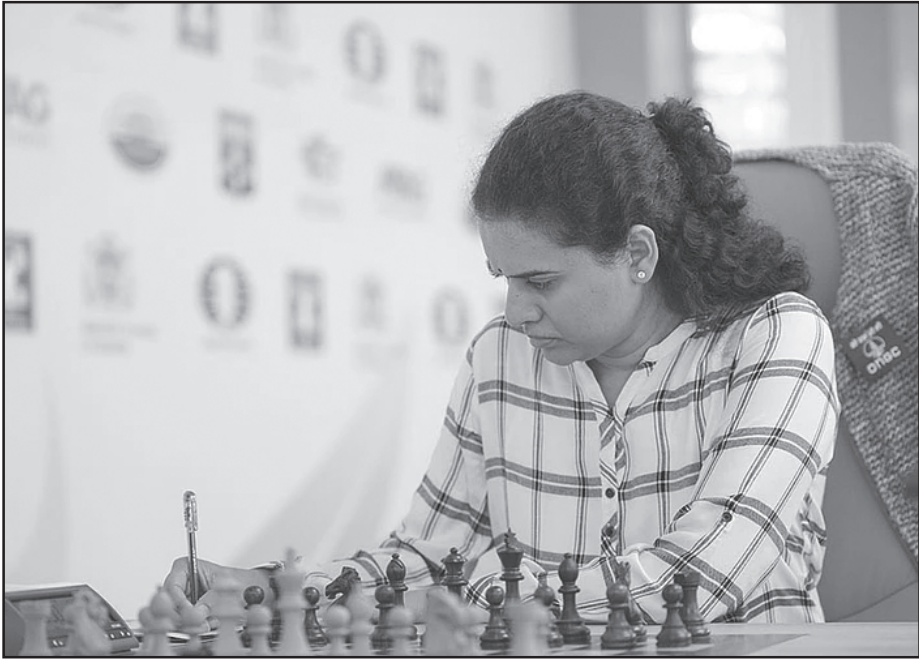
India's Koneru Humpy during semifinal chess match against China's Tingjie Lei at FIDE Women's World Cup 2025, in Batumi, Georgia.

Head coach Khalid Jamil will be eager to see his side rediscover that form and build on it as they aim for a stronger showing in the Durand Cup, having exited at the group stage last year.