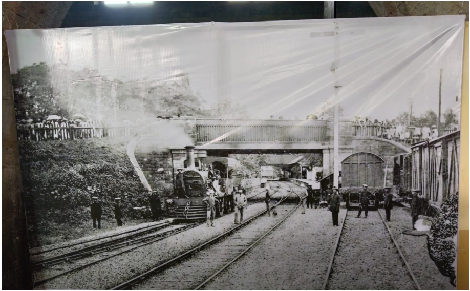
Photo of Old Byculla

The highlight of the exhibition was a GIPR monogram made of gun