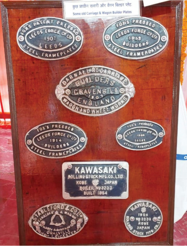
Old Carraige & Wagon badges

1891 is a fine example of Victorian architecture.