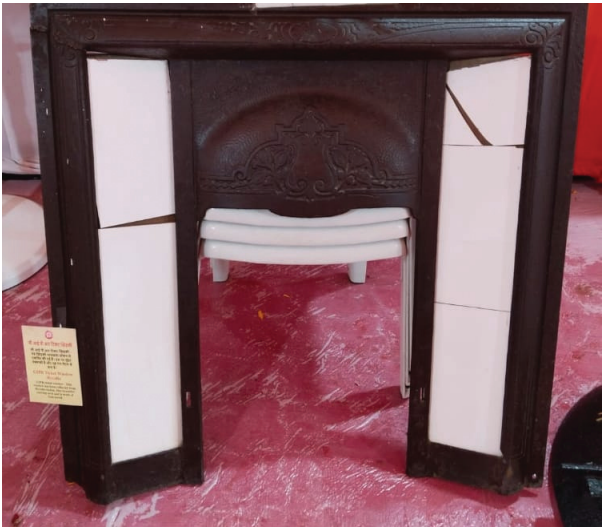
Old GIPR Ticket window frame