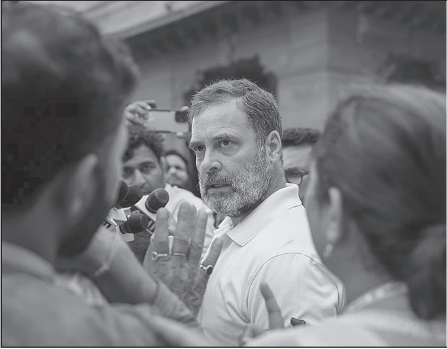
Leader of Opposition in the Lok Sabha and Congress leader Rahul Gandhi speaks to the media during the Monsoon session of Parliament, in New Delhi on Wednesday.

The minister said that the survey, carried out using drone/aerial mapping and ground truthing rover technology, was completed in Salar Nagar of Gandeed mandal in Mahabubnagar district, Kommanapalli-