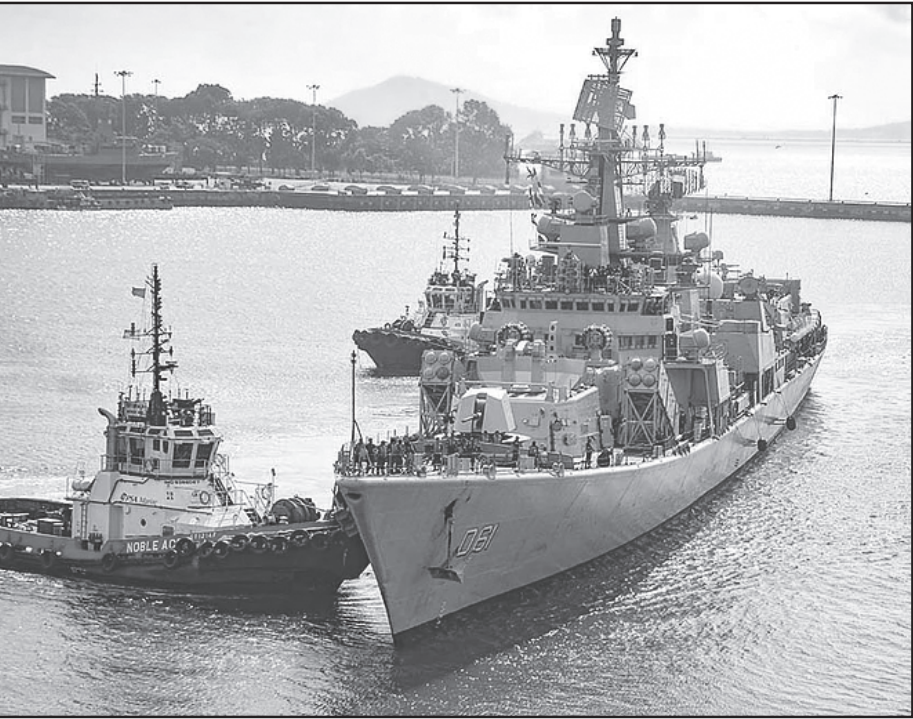
One of the Indian Naval Ships of the Eastern Fleet, under the Command of Flag Officer Commanding Eastern Fleet of the Indian Navy Rear Admiral Susheel Menon, being welcomed in Singapore.

Syria's interim authorities must hold those responsible for the city's killings accountable, the statement read.Damascus later withdrew its forces from the southern province after the Israeli bombings on several Syrian targets, including its state-run-media headquarters, its Defence Ministry, and a military target near the Presidential Palace.