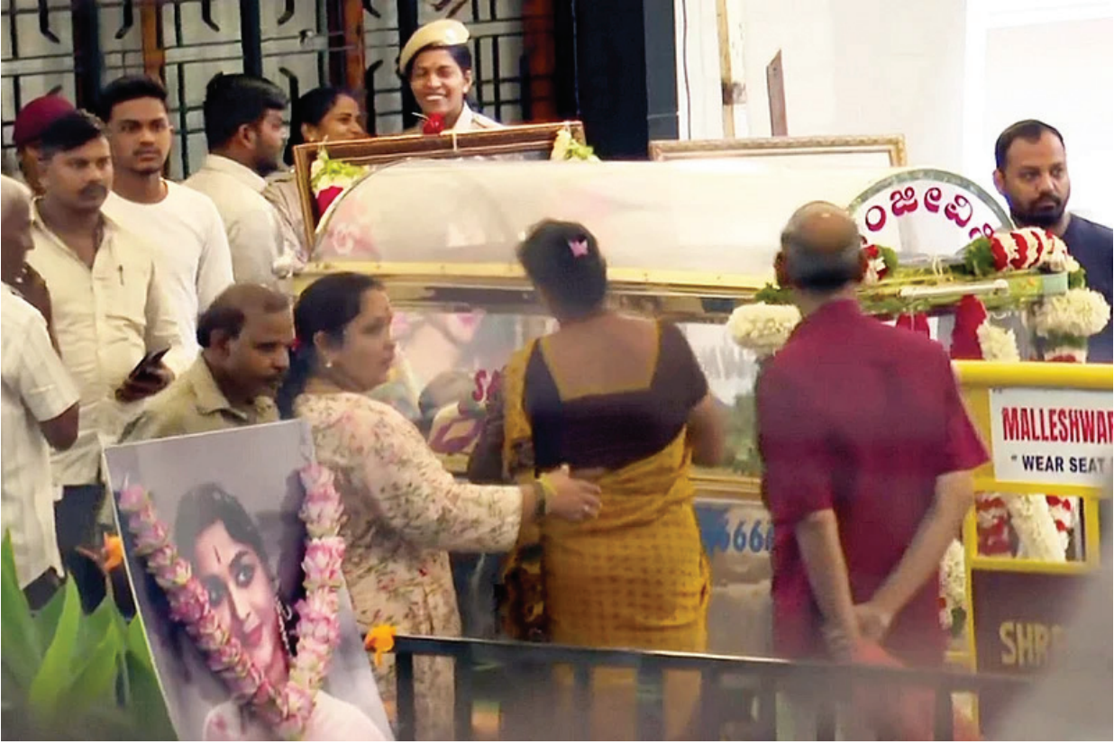
Mortal remains of veteran South Indian actor B Saroja Devi being brought to her residence, in Ramanagara district, Karnataka on Tuesday.

Ax-4, which was originally expected to spend two weeks on the ISS, ended up staying a few days longer. During their stay, Axiom Space said the crew conducted 60 scientific experiments, including seven designed by Indian Space Research Organisation (Isro).