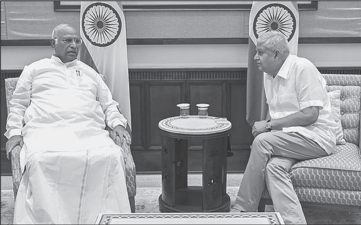
Vice President and Rajya Sabha Chairman Jagdeep Dhankhar with Congress President Mallikarjun Kharge during a meeting, ahead of the Monsoon session of Parliament, in New Delhi on Tuesday.

“From June 18 to Tuesday, DVC released 27,000 lakh cubic meters of water. As a result, parts of districts like West Midnapore, Hooghly, Howrah, and East Midnapore have experienced flooding,” the chief minister said, adding that while states like Assam receive funds during floods, West Bengal is often left out.