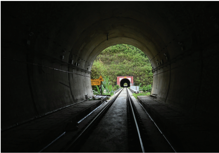
(Standard Post Bureau)

The Last Unexplored Frontier Is Now Just a Train Ride Away