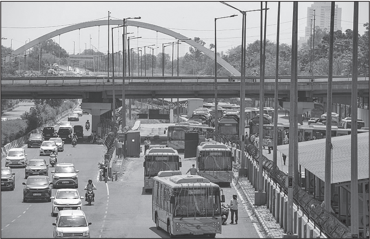
Buses move out of a depot after Prime Minister Narendra Modi flagged off 200 electric buses under the Delhi Government's sustainable transport initiative, on World Environment Day, in New Delhi on Thursday.

Its flagship Immediate Payment Service (IMPS) feature allows direct bank account transfers, setting it apart from traditional wallets that rely on peer-to-peer transactions or UPI, and offering 24/7 availability for seamless banking integration. The ITE&C Department emphasised T Wallet's role in enhancing financial inclusion, particularly in underserved regions, with its growth over eight years underscoring its importance as a state-led digital payment solution for Telangana's citizens.