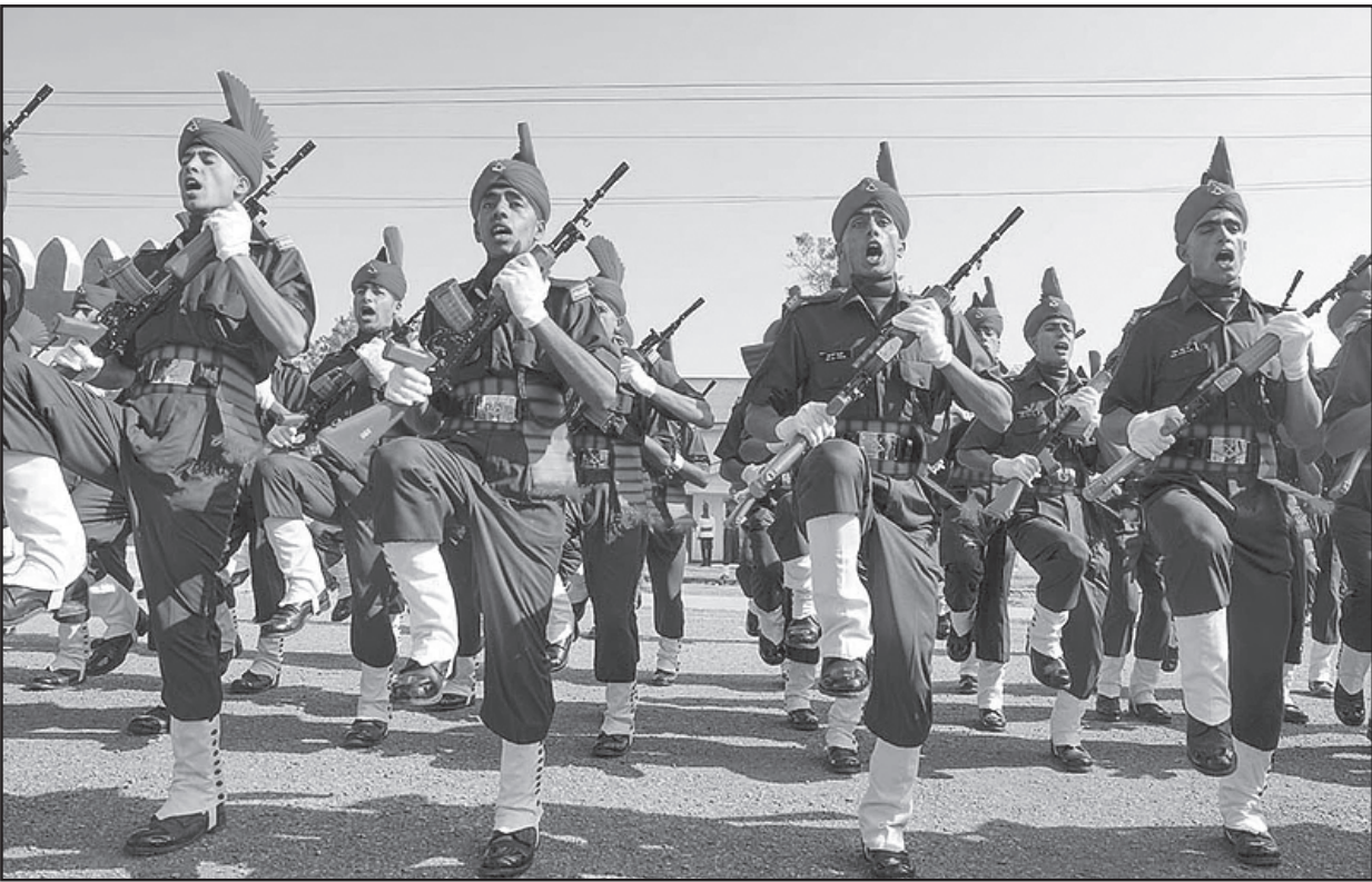
Newly-recruited Indian army soldiers during attestation cum passing out parade of the fifth batch of Agniveer, at JAKLI regimental centre, at Rangreth area of Srinagar, Jammu and Kashmir.

He regretted that drowning incidents take place in rural areas.