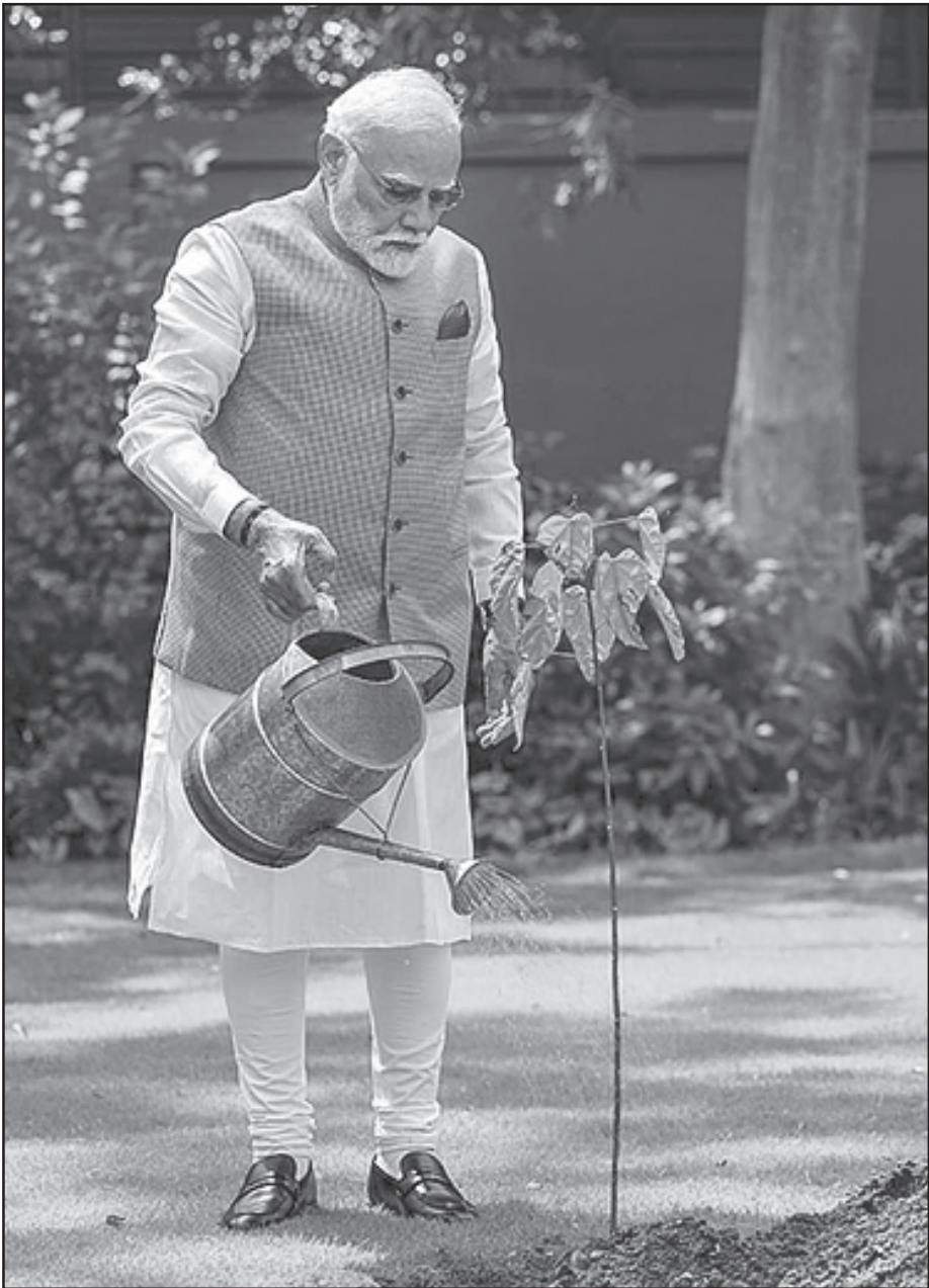
Prime Minister Narendra Modi plants a sapling at his residence on World Environment Day, in New Delhi on Thursday.