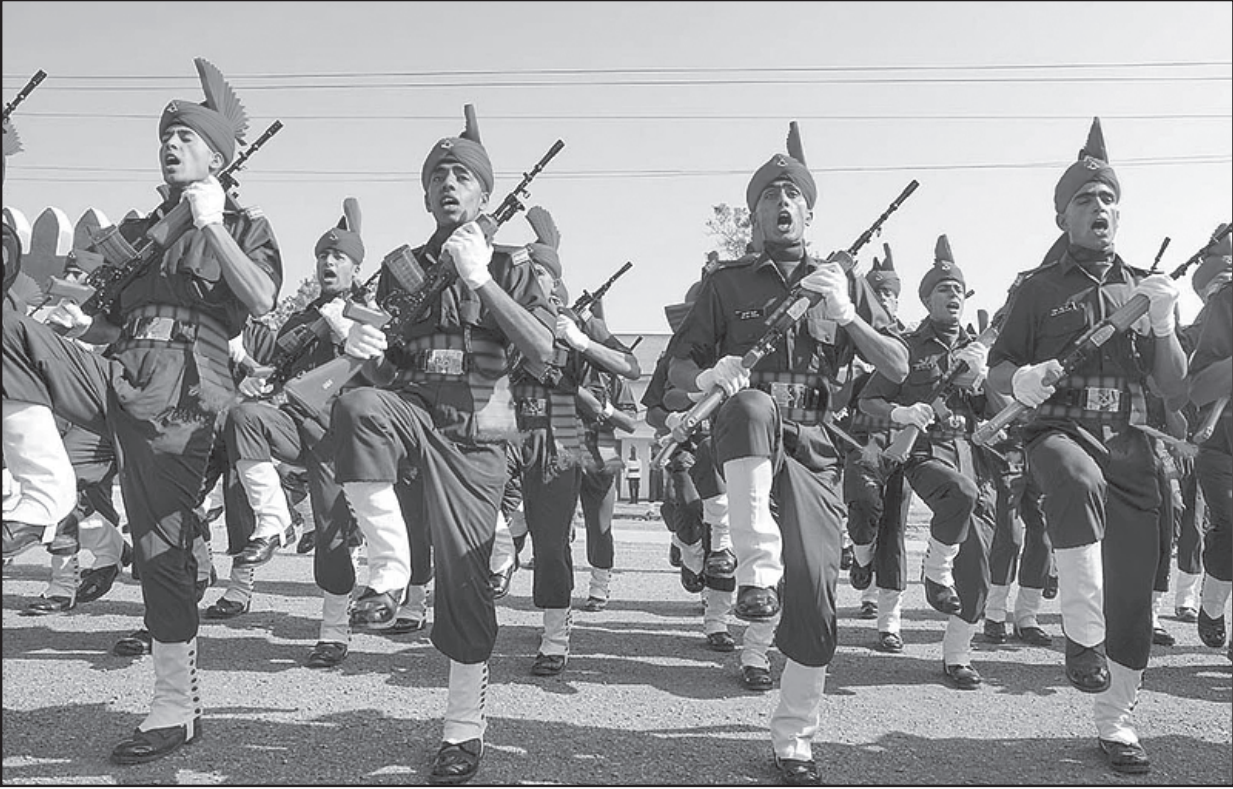
Newly-recruited Indian army soldiers during attestation cum passing out parade of the fifth batch of Agniveer, at JAKLI regimental centre, at Rangreth area of Srinagar, Jammu and Kashmir.

The parade was followed by a melodious pipe band display of martial music with excellent synchronisation.