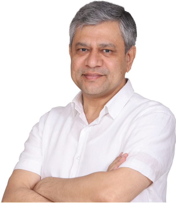
Railway Minister, Ashwini Vaishnaw

Transporting goods by rail costs nearly half of what it does by road. This means big savings, not just for businesses, but for the entire economy. This shift has helped save ₹ 3.2 lakh