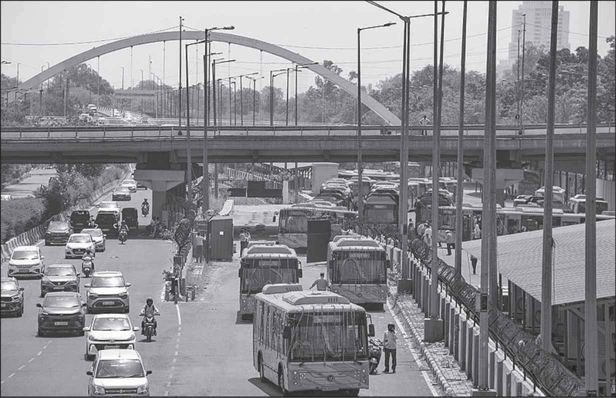
Buses move out of a depot after Prime Minister Narendra Modi flagged off 200 electric buses under the Delhi Government's sustainable transport initiative, on World Environment Day, in New Delhi on Thursday.

Its flagship Immediate Payment Service (IMPS) feature allows direct bank account transfers, setting it apart from traditional wallets that rely on peer-to-peer transactions or UPI, and offering 24/7 availability for seamless banking integration. The ITE&C Department emphasised T Wallet's role in enhancing financial inclusion, particularly in underserved regions, with its growth over eight years underscoring its importance as a state-led digital payment solution for Telangana's citizens.