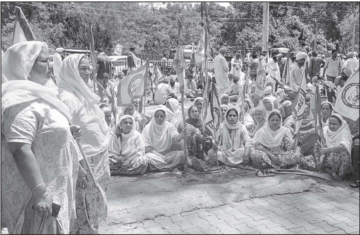
Farmers protest against the Punjab Government over a village land allotment dispute, demanding a resolution, in Patiala.

He said, despite the police restrictions, the ‘Betrayal Day’ was a grand success with people voicing their dissent in unison as the election promises were not fulfilled by Chandrababu Naidu and drew a contrast with YS Jagan Mohan Reddy’s term, where 99 per cent of the promises were delivered on the dot. People felt cheated as the existing schemes were stopped and the promised ones were not rolled out, and this has a clear reflection in success of ‘Betrayal Day’, he said adding that YS Jagan Mohan Reddy even in opposition was always with the people while Chandrababu away from the people and the State between 2019-24.