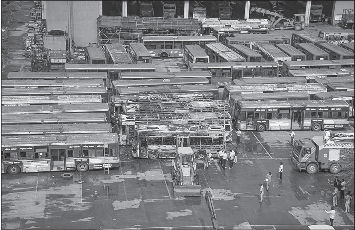
Four public transport buses of Navi Mumbai Municipal Transport (NMMT) gutted in a fire at NMMT's Ghansoli Bus Depot, in Navi Mumbai.