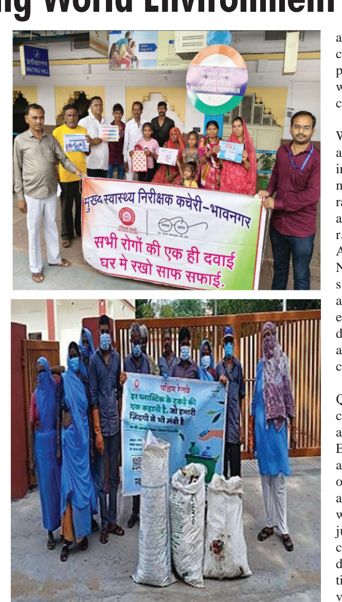
Glimpses of various activities being carried out under World Environment Day campaign across Western Railway.

Mr Vineet informed that, A 'Reduce Plastic Pollution campaign was observed across Western Railway during which a series of impactful activities were carried across all six divisions as well as Workshops. Passengers were educated and encouraged to make use of plastic bottle crushing machines to dispose off single use plastic bottles and reduce littering at stations. Food Stalls and water refill points were inspected to reduce single use plastic usage. Additionally, through public announcements at