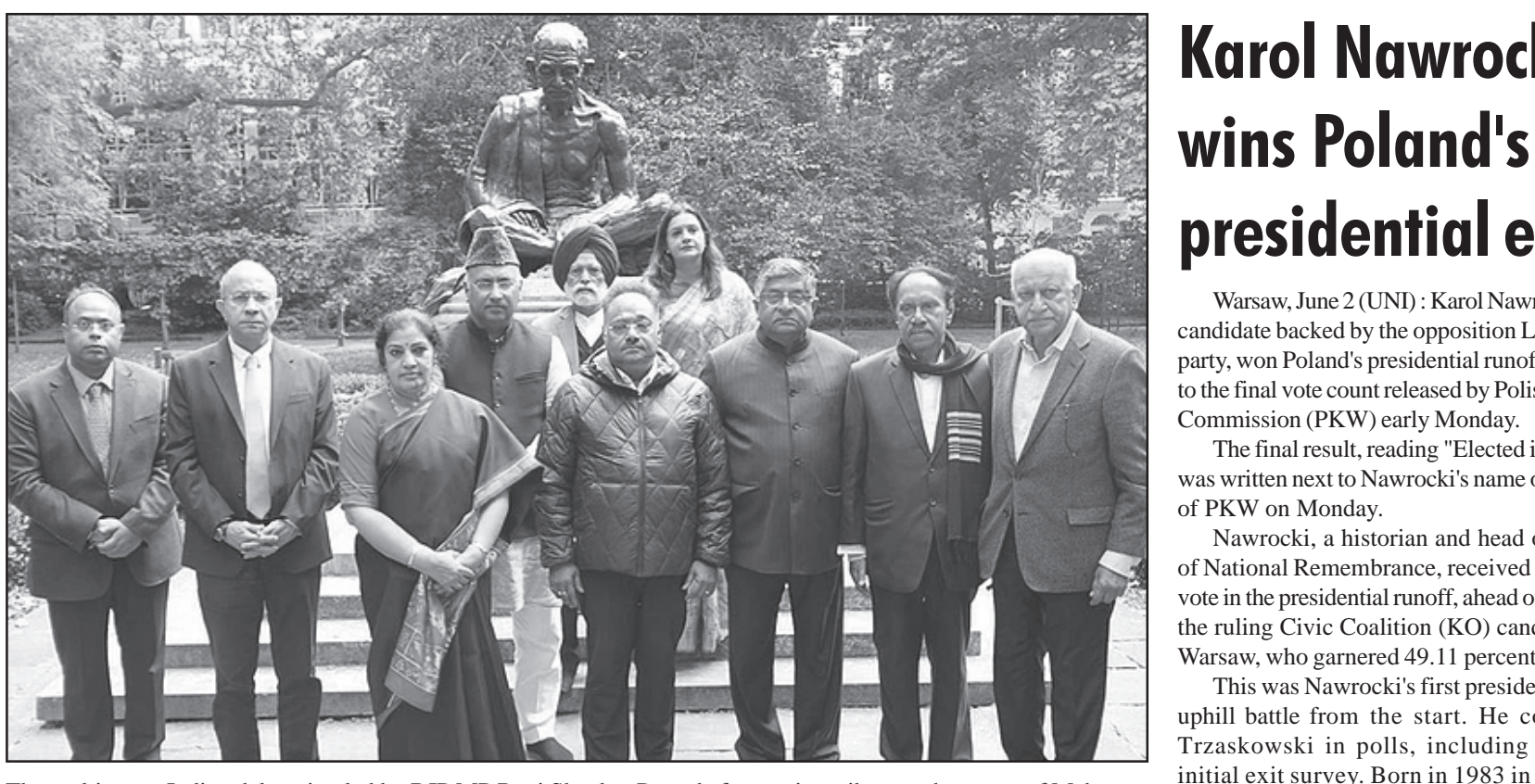
The multi-party Indian delegation led by BJP MP Ravi Shankar Prasad after paying tribute at the statue of Mahatma Gandhi at Tavistock Square Gardens in central London on Monday.

Reportedly, the Ayeyarwady River, had risen by about 10 feet that morning, and remains at 1,105 centimetres — just 95 centimetres below the danger level of 1,200 centimetres—causing huge flooding in low-lying areas. Supervised by the state government, Kachin's Chief Minister U Khet Htein Nan inspected the flood relief camps, assessed the efforts of state authorities in carrying out relief work, and reviewed the operational readiness of rescue boats and equipment.In addition, he evaluated arrangements for swift evacuations, and search and rescue operations using boats. He urged flood relief team, aided by rescue teams from both the police and the military, to continuously monitor the situation, keep communication lines open and inform the public, conduct timely search and rescue operations, and also presented awards to the rescue teams. He also inspected the flood relief camp at No 12 Basic Education High School in Lekon (Zeelun) Ward, reviewing the conditions of 1,228 evacuated people from 151 households, rallying the public and delivering powerful speeches to the flood victims and provided them with rice, oil, eggs, instant noodles, porridge sachets, and drinking water for their families.