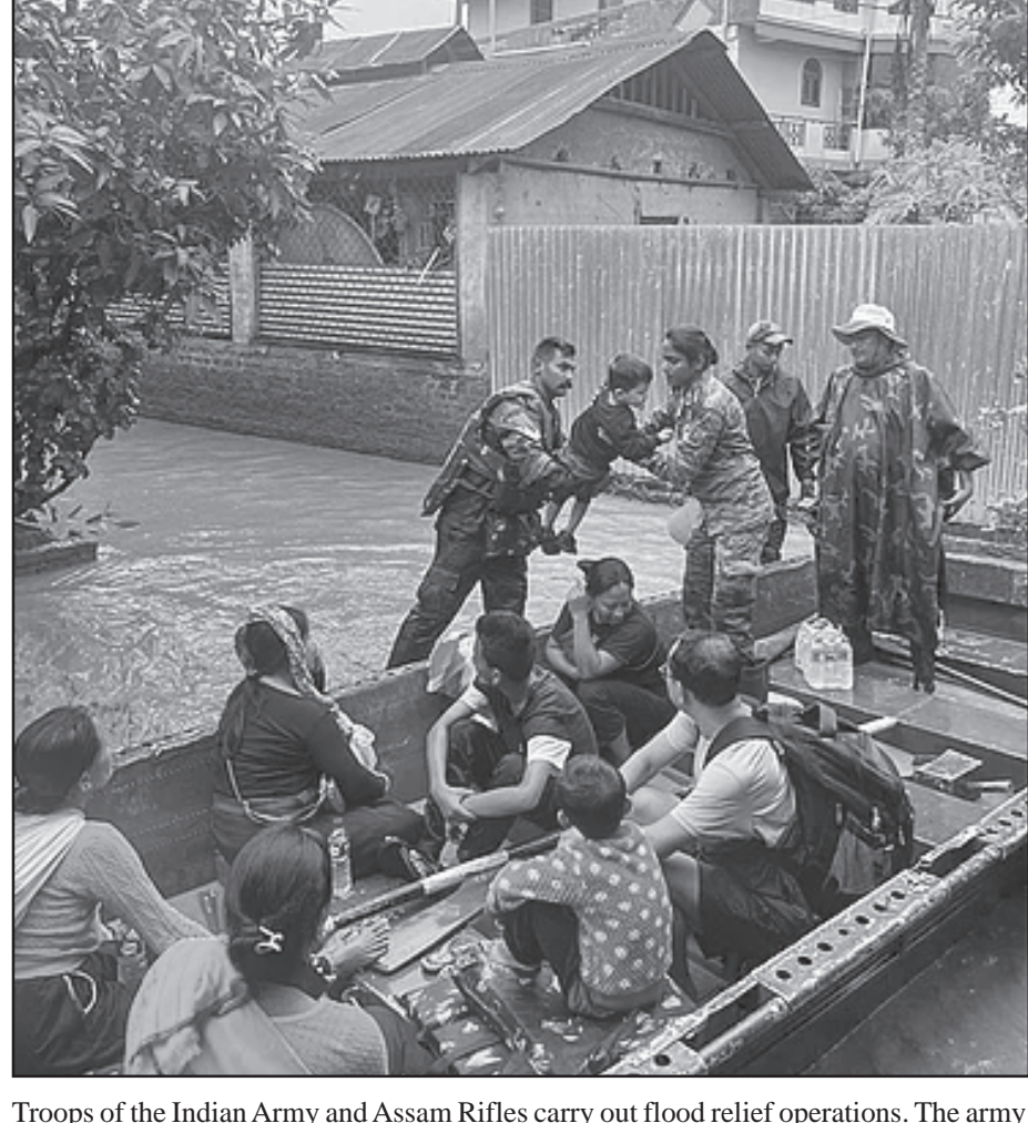
Troops of the Indian Army and Assam Rifles carry out flood relief operations. The army carried out relief works in Tripura, south Assam, and Jiribam in Manipur, rescuing over 100 civilians from inundated areas, in coordination with civil administration.

Condemning the terrorist attack Pahalagam, Chouhan said that India responded strongly by destroying terrorist camps in just 25 minutes, forcing Pakistan to retreat within three days. He added that the Indus Waters Treaty, which had previously allocated 80 percent of the river water to Pakistan, has been annulled, and India has declared firmly that "blood and water cannot flow together." Indian water is for Indian farmers.