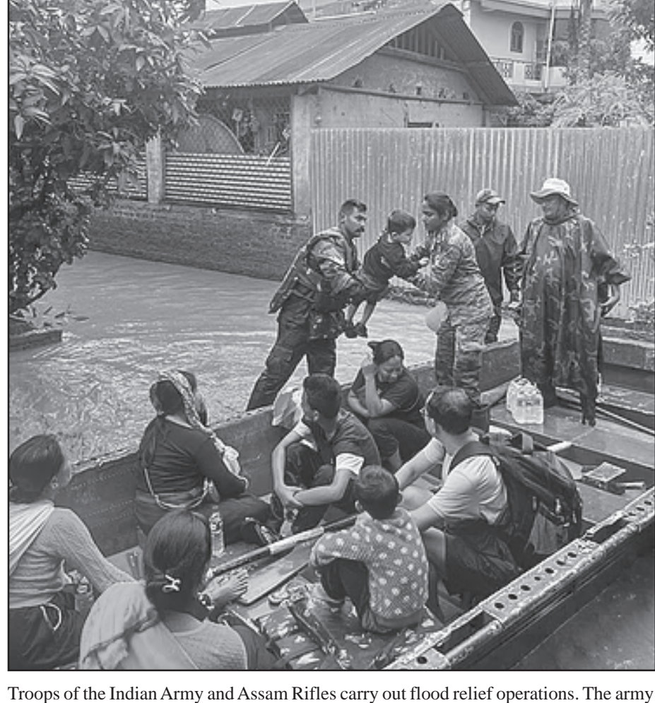
carried out relief works in Tripura, south Assam, and Jiribam in Manipur, rescuing over 100 civilians from inundated areas, in coordination with civil administration.

Condemning the terrorist attack Pahalagam, Chouhan said that India responded strongly by destroying terrorist camps in just 25 minutes, forcing Pakistan to retreat within three days. He added that the Indus Waters Treaty, which had previously allocated 80 percent of the river water to Pakistan, has been annulled, and India has declared firmly that "blood and water cannot flow together." Indian water is for Indian farmers.