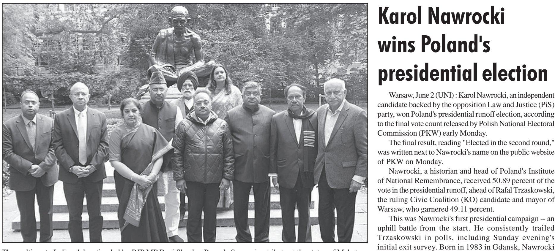
The multi-party Indian delegation led by BJP MP Ravi Shankar Prasad after paying tribute at the statue of Mahatma Gandhi at Tavistock Square Gardens in central London on Monday.

Reportedly, the Ayeyarwady River, had risen by about 10 feet that morning, and remains at 1,105 centimetres — just 95 centimetres below the danger level of 1,200 centimetres—causing huge flooding in low-lying areas. Supervised by the state government, Kachin's Chief Minister U Khet Htein Nan inspected the flood relief camps, assessed the efforts of state authorities in carrying out relief work, and reviewed the operational readiness of rescue boats and equipment.In addition, he evaluated arrangements for swift evacuations, and search and rescue operations using boats. He urged flood relief team, aided by rescue teams from both the police and the military, to continuously monitor the situation, keep communication lines open and inform the public, conduct timely search and rescue operations, and also presented awards to the rescue teams. He also inspected the flood relief camp at No 12 Basic Education High School in Lekon (Zeelun) Ward, reviewing the conditions of 1,228 evacuated people from 151 households, rallying the public and delivering powerful speeches to the flood victims and provided them with rice, oil, eggs, instant noodles, porridge sachets, and drinking water for their families.