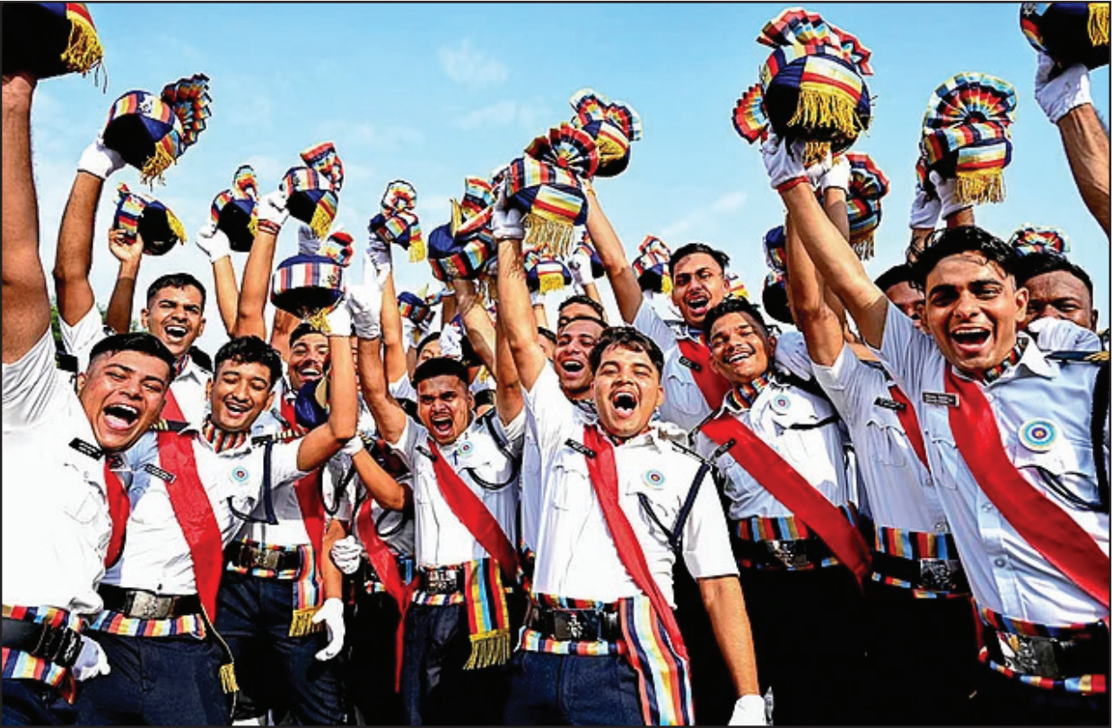
Students of the 28th batch of B. Tech (Fire Engineering) celebrate after their passing out parade at the National Fire Service College (NFSC), in Nagpur on Monday.

She lauded their hard work, focus, and perseverance, calling their success a reflection of their discipline and the supportive academic environment provided by the school.