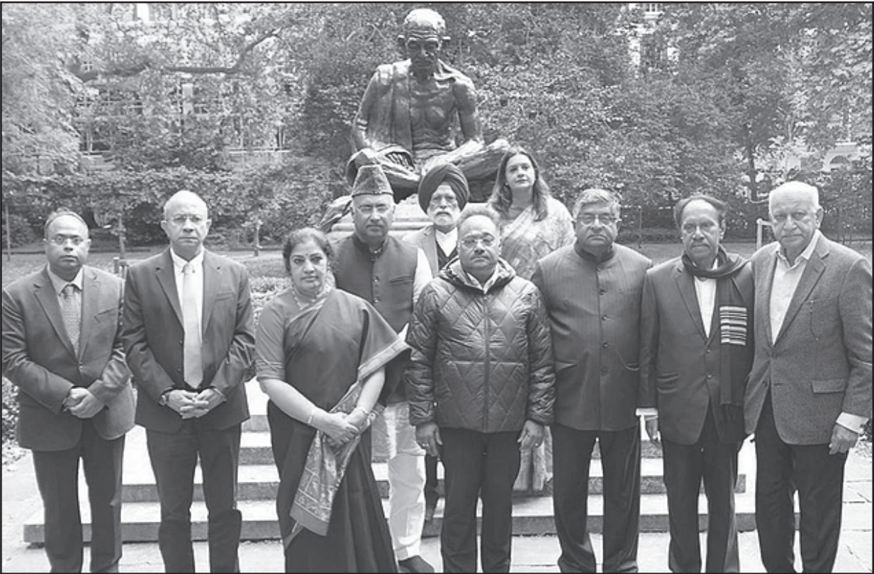
The multi-party Indian delegation led by BJP MP Ravi Shankar Prasad after paying tribute at the statue of Mahatma Gandhi at Tavistock Square Gardens in central London on Monday.

Reportedly, the Ayeyarwady River, had risen by about 10 feet that morning, and remains at 1,105 centimetres — just 95 centimetres below the danger level of 1,200 centimetres—causing huge flooding in low-lying areas.Supervised by the state government, Kachin's Chief Minister U Khet Htein Nan inspected the flood relief camps, assessed the efforts of state authorities in carrying out relief work, and reviewed the operational readiness of rescue boats and equipment.In addition, he evaluated arrangements for swift evacuations, and search and rescue operations using boats.He urged flood relief team, aided by rescue teams from both the police and the military, to continuously monitor the situation, keep communication lines open and inform the public, conduct timely search and rescue operations, and also presented awards to the rescue teams.He also inspected the flood relief camp at No 12 Basic Education High School in Lekon (Zeelun) Ward, reviewing the conditions of 1,228 evacuated people from 151 households, rallying the public and delivering powerful speeches to the flood victims and provided them with rice, oil, eggs, instant noodles, porridge sachets, and drinking water for their families.