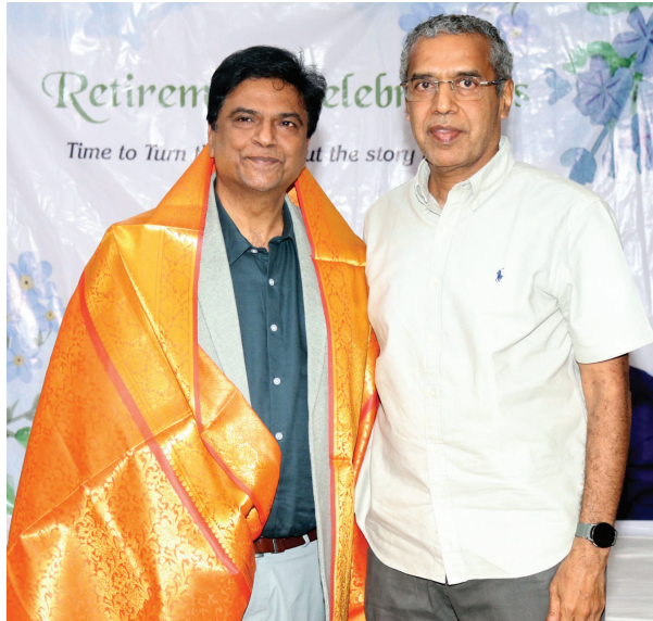
(By Snaps India)

The report also reveals how these platforms attract such massive traffic. Around 66 per cent of users visit directly, often through saved links, private messages, or bookmarks, giving a false impression of trust and legitimacy. Big media campaigns, celebrity endorsements, billboards, and SEO-boosted search visibility further increase their reach.