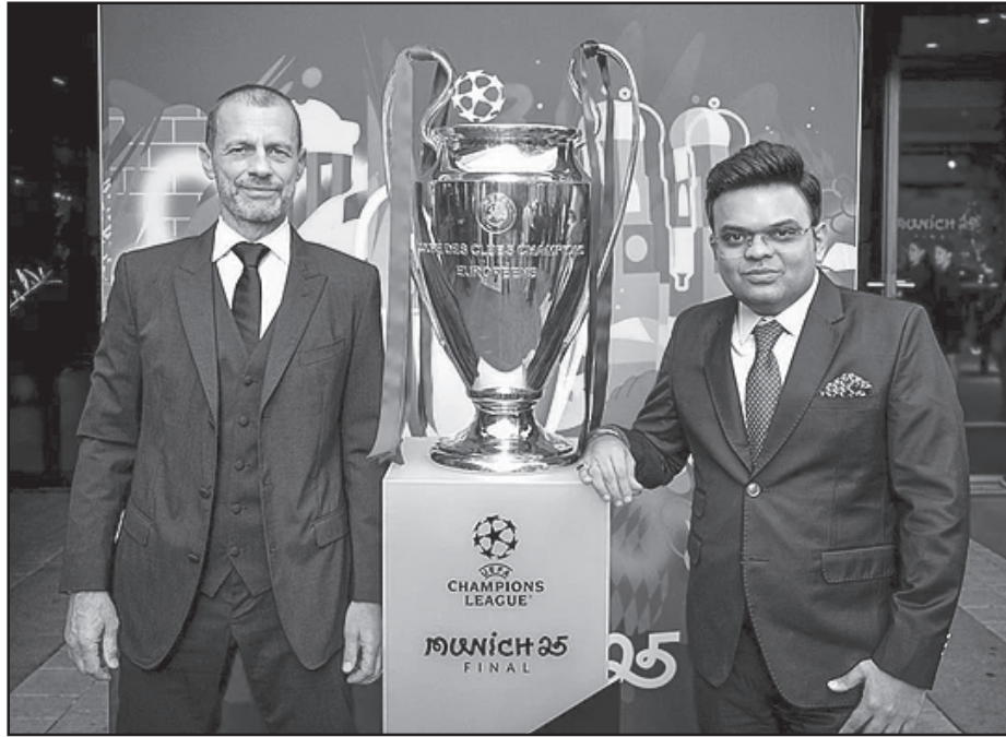
ICC chairman Jay Shah during a meeting with UEFA President Aleksander Ceferin, ahead of Saturday's Champions League final between Inter Milan and Paris Saint-Germain, in Munich on Saturday.