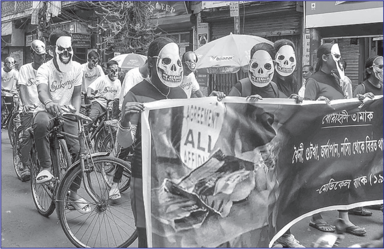
Students wear masks as they ride bicycles during a rally organised on ‘World No-Tobacco Day’, in Kolkata.