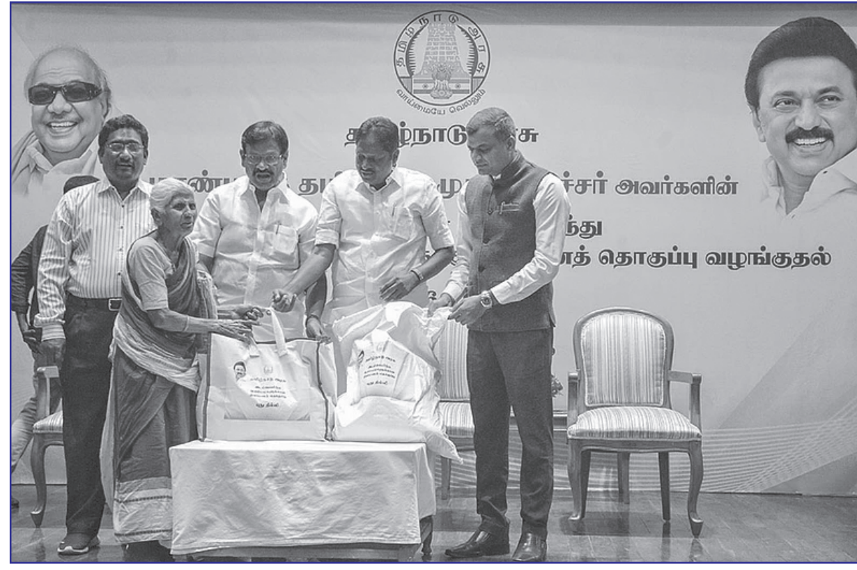
Relief package being distributed among displaced Tamil families, who were residing at Madarasi Camp of Delhi's Jangpura area, in New Delhi. The relief package has been announced by the Tamil Nadu CM under the Chief Minister's Public Relief Fund (CMPRF).

A total of 10 candidates are in the fray, including Aryadan Shoukath (UDF), M Swaraj (LDF), Mohan George (BJP) and former MLAPV Anvar, who is contesting as an independent candidate. There are 1,13,613 male voters and 1,18,760 female voters and eight transgender voters, of which 7,787 are new voters. The number of non-resident voters is 373 and service voters is 324.