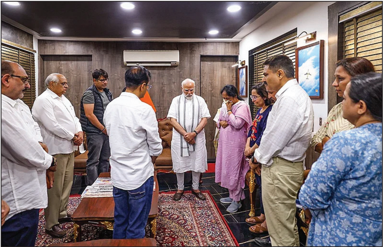
In this image via @narendramodi on X, Prime Minister Narendra Modi meets family members of former Gujarat chief minister Vijay Rupani, who died after an Air India plane carrying him and 241 others crashed in Ahmedabad on Thursday.