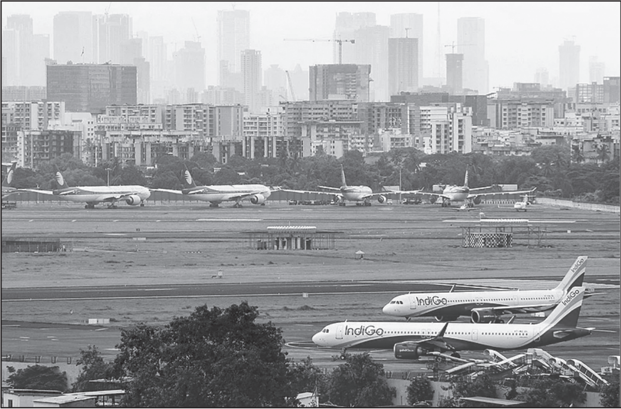
Flights parked on the runway at Chhatrapati Shivaji Maharaj International Airport, in Mumbai. Several Air India flights were either diverted or returned to origin amid escalating tensions between Iran and Israel. Iran has closed its airspace due to the ongoing conflict.