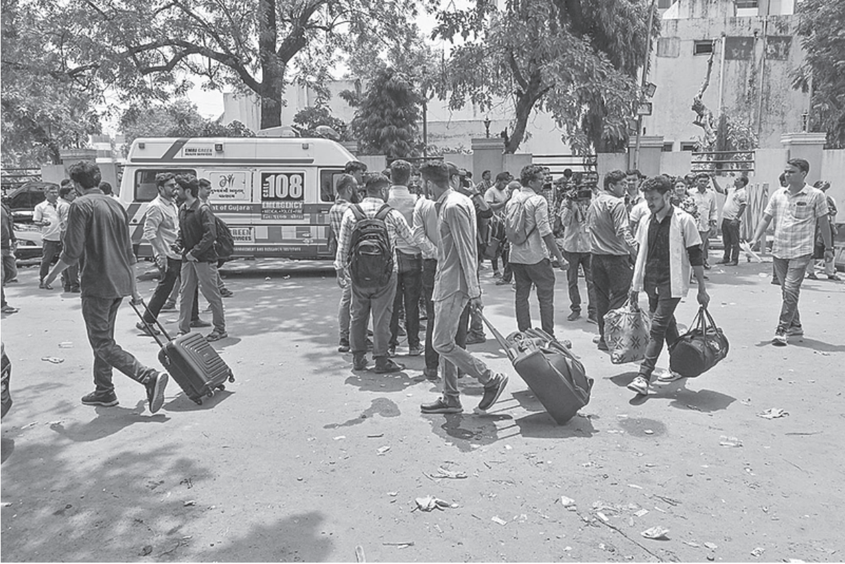
Resident doctors and medical students carry their belongings from the damaged government hostel a day after an Air India flight crashed into the building, in Ahmedabad on Friday.