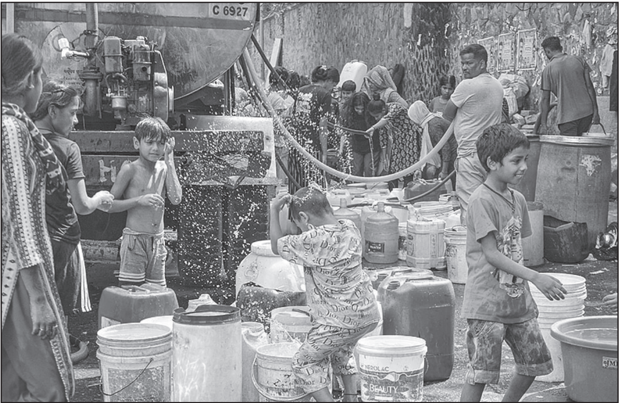
a tanker amid water crisis, on a hot summer day, at Sanjay Camp, Chanakyapuri, in New Delhi on Monday.