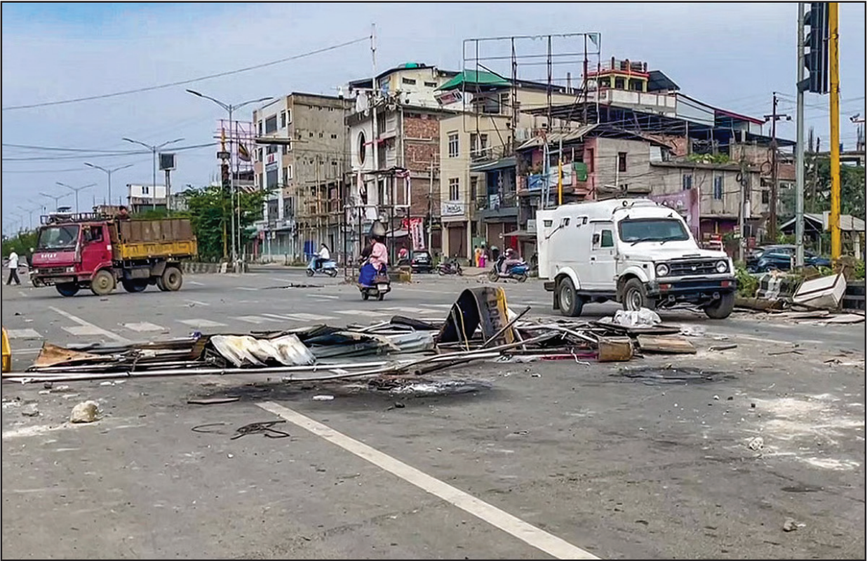
A road leading to Imphal is blocked by residents amid ongoing protests over ongoing violence, near Imphal on Monday.