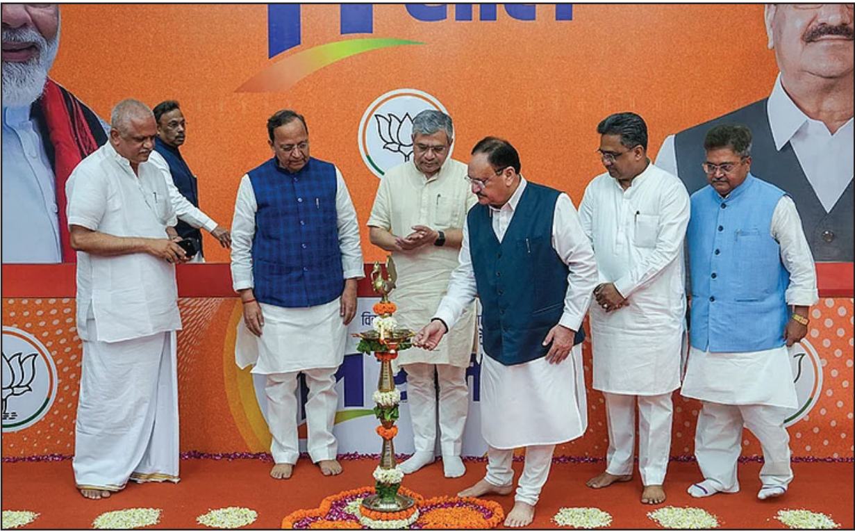
BJP National President Jagat Prakash Nadda with party leaders inaugurates an exhibition after addressing a press conference on "Viksit Bharat Ka Amrit Kaal: Seva, Sushasan aur Garib Kalyan ke 11 Saal," marking the completion of 11 years of the NDA government under the leadership of Prime Minister Narendra Modi, at the BJP headquarters in New Delhi on Monday.

In its suit, Tamil Nadu seeks a direction for the Union Government to release the pending Rs 2,291 crore along with applicable interest. The state also seeks a declaration that making the release of SSS funds contingent upon the adoption of NEP 2020 and the PM SHRI scheme is "unconstitutional, illegal, unreasonable, and arbitrary."