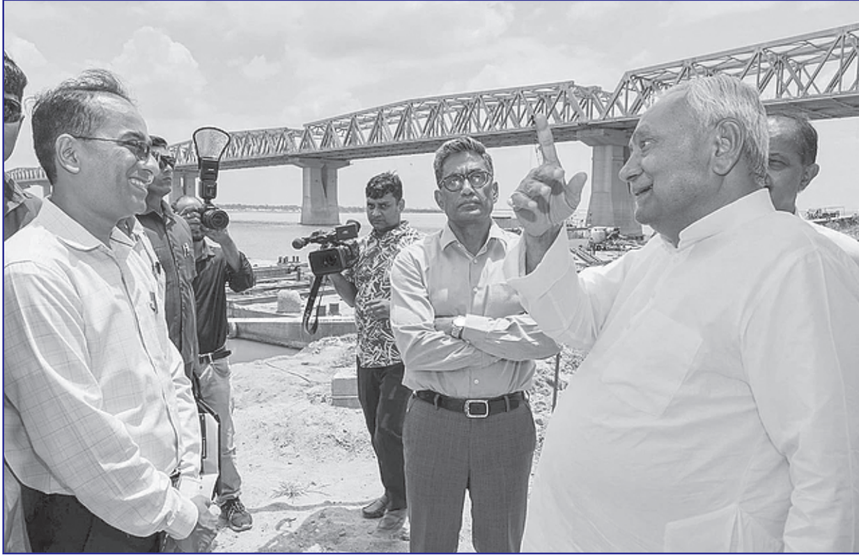
Bihar Chief Minister Nitish Kumar during an inspection of the JP Ganga Path, in Patna.

Addressing a video conference held under his chairmanship from New Delhi, Kishan Reddy proposed the formation of a committee comprising Singareni officials and