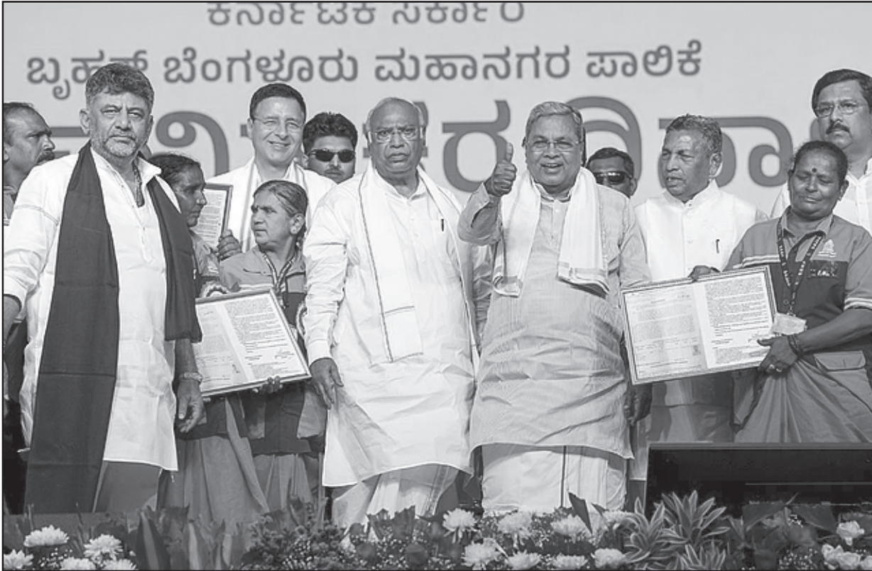
Karnataka Chief Minister Siddaramaiah, Deputy CMDK Shivakumar and Congress President and Leader of Opposition in Rajya Sabha Mallikarjun Kharge hand over the permanent employment certificate to 'Pourakarmikas', civic workers during an event to regularise the service of civic workers under the Bruhat Bengaluru Mahanagara Palike (BBMP), in Bengaluru, Karnataka. Congress leader Randeep Surjewala is also seen.

sound of India carries a touch of the divine”. He assured that the government stands firmly behind creative professionals, supporting them through initiatives like Skill India, Startup Support, policies for the AVGC Industry, and global platforms like WAVES. He asserted that every effort is being made to build an environment where innovation and imagination are valued, fostering new dreams and empowering individuals to bring those dreams to life. Modi expressed his unwavering confidence in India’s content creators, highlighting that their free-flowing creativity is redefining the global creative landscape. He emphasised that the youthful spirit of India's creators knows no barriers, boundaries, or hesitation, allowing innovation to thrive. He remarked that through his personal interactions with young creators, gamers, and digital artists, he has witnessed firsthand the energy and talent emerging from India's creative ecosystem. He acknowledged that India's massive young population is driving new creative