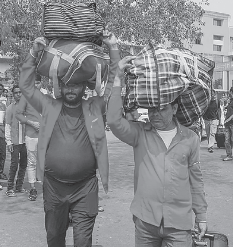
Porters carry luggage at the New Delhi railway station, on International Workers' Day, also known as May Day, in New Delhi on Thursday.

With this innovative AVC feature, guests can verify their visa in real time during online check in, up to 14 days and until one (1) hour before scheduled departure time, from the comfort of their home or while on the go.For guests travelling with hand-carry luggage only, they may proceed directly to the boarding gate using their e-boarding pass (where applicable) or reprint their boarding pass at the self-service kiosk if needed. Guests with checked baggage may print their bag tags at the kiosk and drop their bags at the designated baggage drop counter.