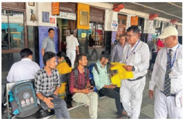
Glimpses of various activities being carried out under World Environment Day campaign across Western Railway.

(Standard Post Bureau) Mumbai, May 28 : Western Railway (WR) is observing World Environment Day campaign from 22nd May to 5th June, 2025, with the central theme “Ending Plastic Pollution.” The initiative underscores WR’s ongoing commitment to environmental sustainability and reducing plastic waste across its operations.