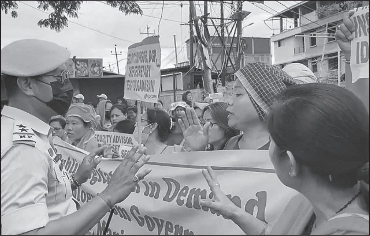
Police try to stop women protestors who were demanding an apology from Manipur Governor Ajay Kumar Bhalla over the alleged removal of 'Manipur' signage from state bus, in Imphal on Wednesday.

In addition, the airline's website offers fab deals for loyalty members, including a 25 percent discount on Xpress Biz fares and upgrades to Xpress Biz seats – the airline's business class equivalent with an industry-leading seat pitch of up to 58 inches.