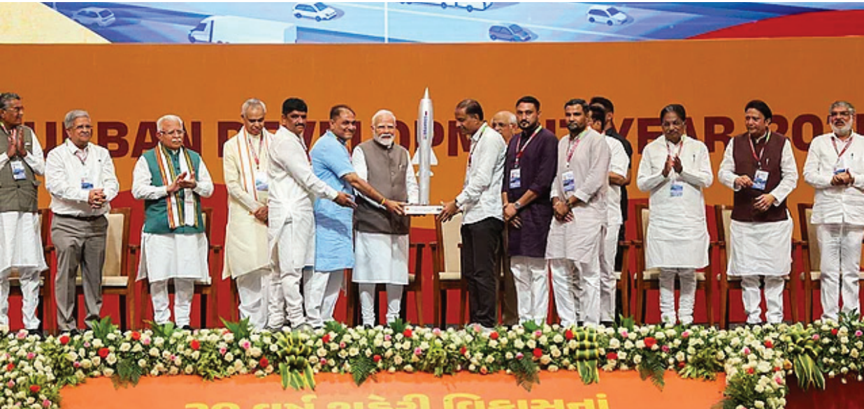
Prime Minister Narendra Modi receives a model of BrahMos missile during an event organised to celebrate 20 years of Gujarat Urban Growth Story, in Gandhinagar on Tuesday.

Gandhinagar, May 27 (UNI) : Prime Minister Narendra Modi on Tuesday said that India has made up its mind to weed out the thorn of terrorism and pursue it with full conviction.