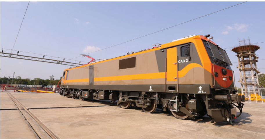
(Standard Post Bureau)

Indian Railways has taken a major leap in freight mobility with the dedication of the Loco Manufacturing Shop at the Rolling Stock Workshop in Dahod, Gujarat by Hon'ble Prime Minister Shri Narendra Modi. This moment marked a pivotal milestone in the ongoing transformation of freight transport. The facility, designed to produce 1,200 cutting-edge electric freight locomotives with a powerful 9000 HP capacity, stands as a testament to India's engineering prowess and industrial ambition.