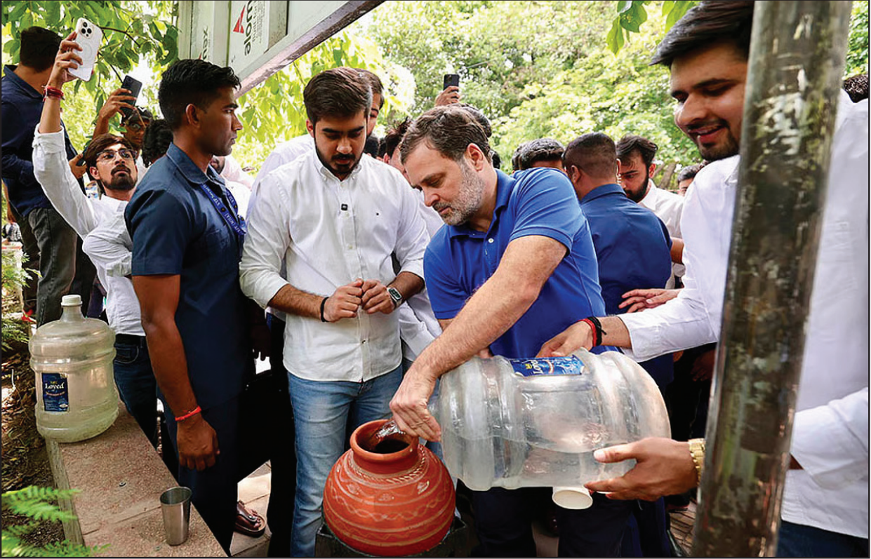
Leader of Opposition in the Lok Sabha Rahul Gandhi during a meeting with DUSU students in New Delhi. Gandhi alleged that qualified SC/ST/OBC candidates are being deliberately disqualified and kept away from leadership roles.

Thunderstorms accompanied by lightning and gusty winds speed ranging from 40-50 kmph is likely to occur at Isolated places in Coastal Andhra Pradesh, Yanam and Rayalaseema during the next five days.