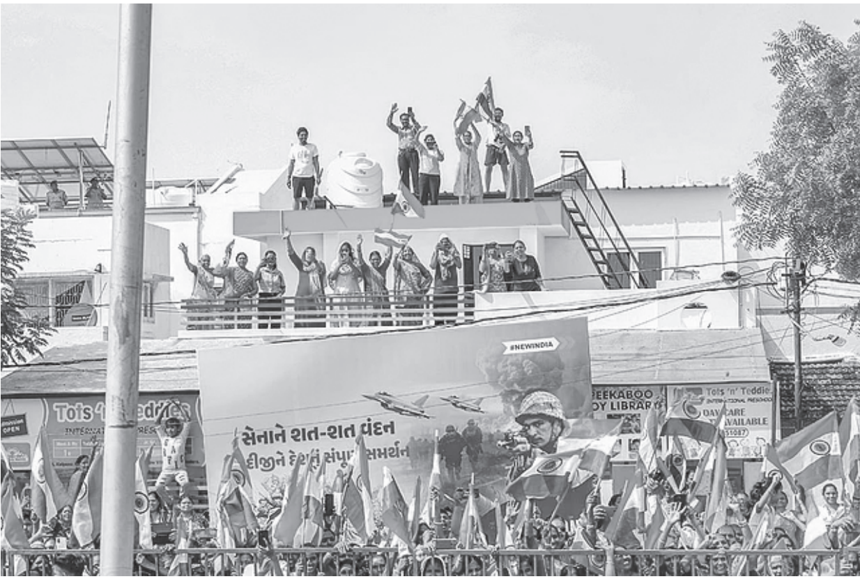
Supporters at Prime Minister Narendra Modi's roadshow in Vadodara, Gujarat on Monday.