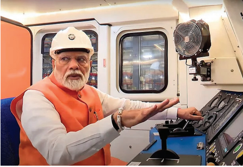
In this image posted by X/@narendramodi, Prime Minister Narendra Modi during dedication of the Loco Manufacturing Shop in Dahod to the nation.

Heavy rainfall occurred over Prakasam district in Coastal Andhra Pradesh during the last 24 hours.